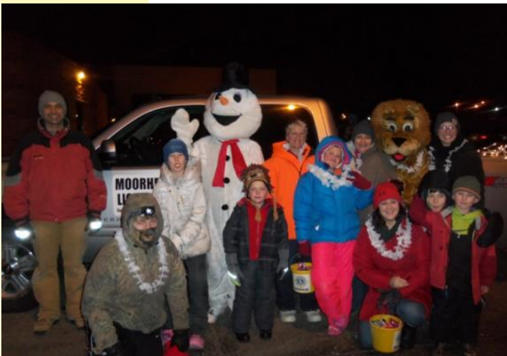
The Moorhead Lions members and families with Frosty the Snowman and our Lion mascot.