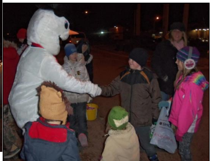
Frosty the Snowman enjoyed greeting people along the way and was stopped by many children and adults alike to get a picture taken with him.