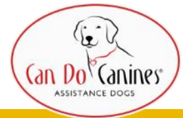
PID Brian Sheehan.

To learn more about Can Do Canines visit can-do-canines.org .