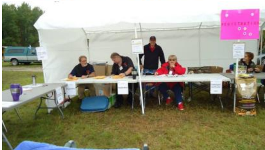
River City Labrador Enthusiasts at registration