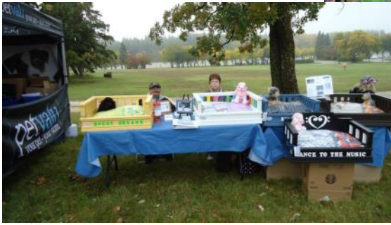
Shadows Mission with custom dog beds