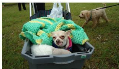
Start of the walk: Really? You're making me walk again this year?