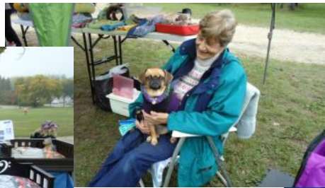
So many familiar faces who come back every year to support the walk