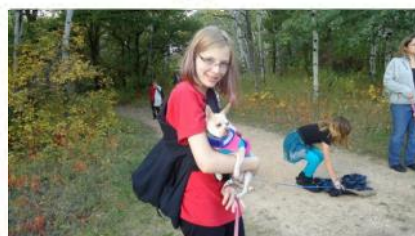
End of the walk: Yeah, someone carried me over the finish line.