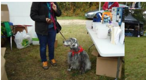
Daisy has been here for many walks