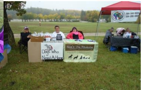
Dogs Who Need A Home and Tess's Dog Training