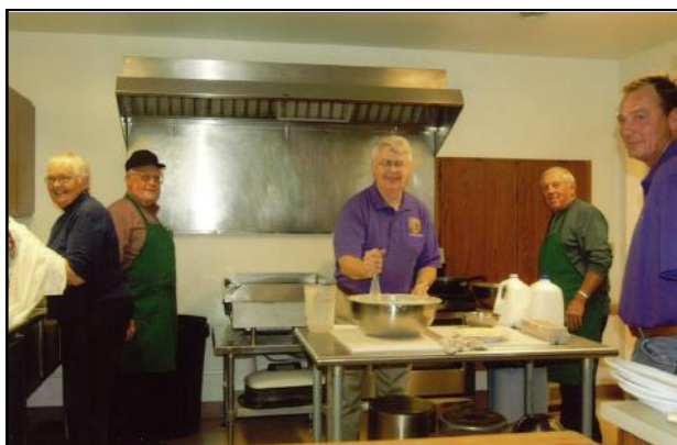
Great St. Hilaire Lions working in the kitchen.