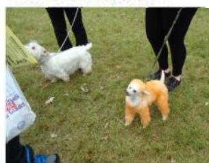
They came in all colors