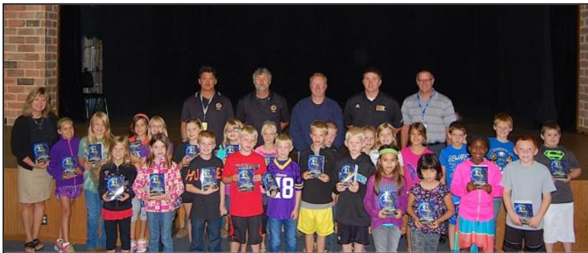
Ulen Lions distributing dictionaries to the 3rd graders at Ulen/Hitterdal.

Members from each club distributed dictionaries to the classrooms while discussing the importance of Lions groups. This project was an example of the International Governor's challenge to engage our youth. The Flom & Area Lions representatives further engaged the 3rd graders by asking for their assistance to help our Lions group with eye glasses collections as a fall class service project.