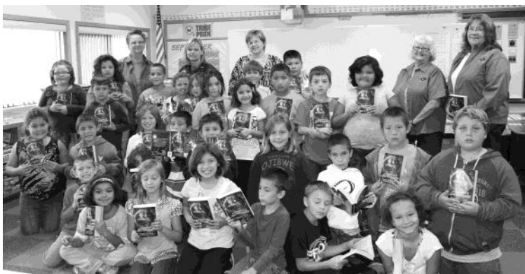
Flom & Area Lions distributing dictionaries to the 3rd graders at Mahnomen Elementary.