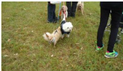
They came from all over...