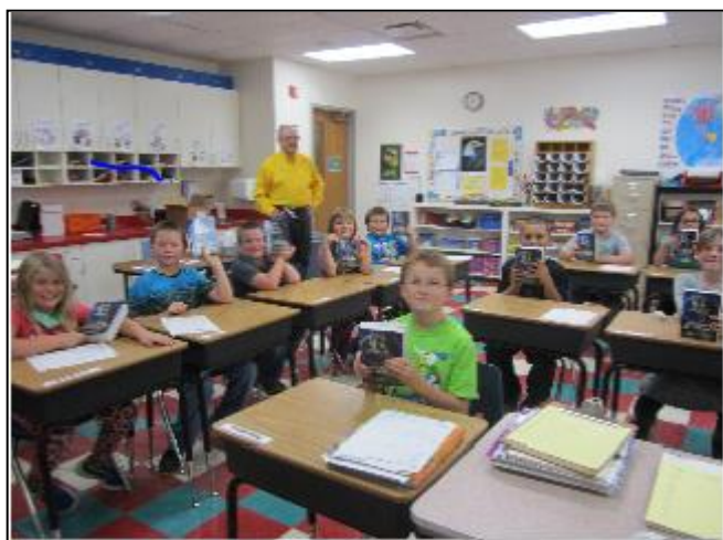
Twin Valley Lions distributing dictionaries to the 3rd graders at Norman County East.