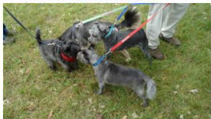
They came by the pack