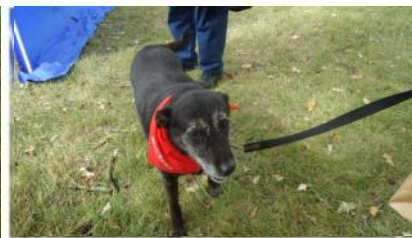
They came because they could