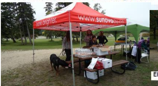
Sunova Credit Union keeping the bi-peds hydrated