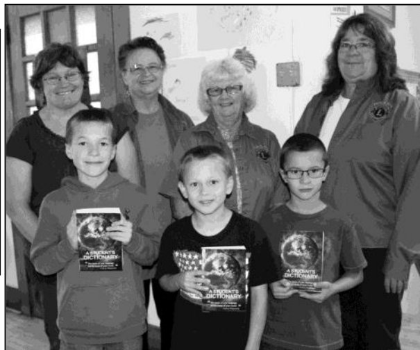
Flom & Area Lions distributing dictionaries to the 3rd graders at St Michaels in Mahnomen.