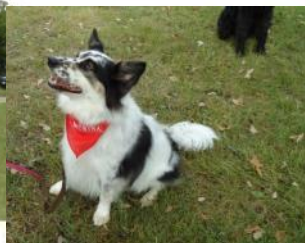
They came in all sizes