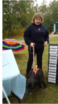
This handsome fella is available for adoption from Umbrella All Animal Rescue