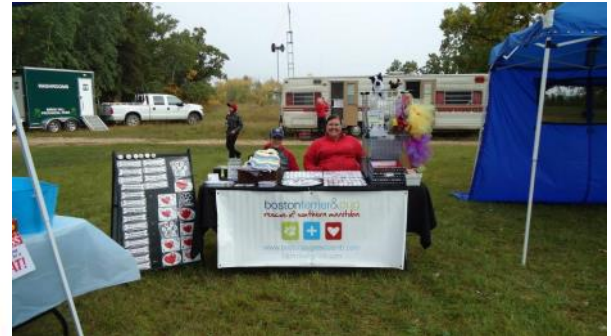
Boston Terrier and Pug Rescue of Southern MB