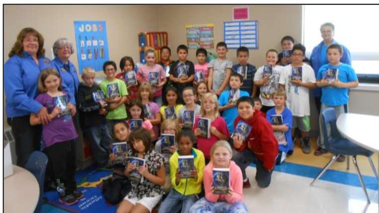
Flom & Area Lions giving dictionaries to the 3rd graders at Ogema Elementary.

Flom & Area Lions Halloween Party for the kids at the Flom Hall on November 2 from 3-5. Come have some fun.