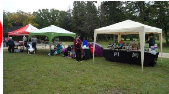
Lots of vendors out to support us this year