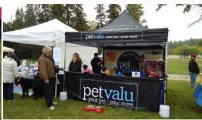
They volunteered their time to support us.