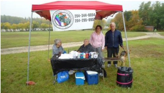
Before the Bridge Senior K9 Rescue