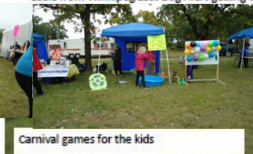
Carnival games for the kids