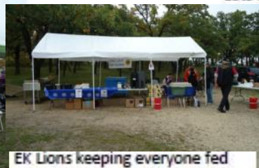
EK Lions keeping everyone fed