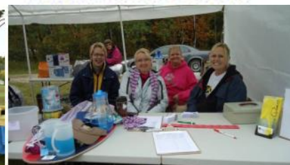
And we appreciate it! Thank you to all for another successful walk!