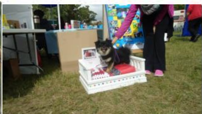
The lucky winner of the custom built dog bed by Shadows Mission