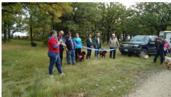
The ribbon cutting for the start of the walk