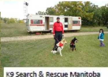
K9 Search & Rescue Manitoba