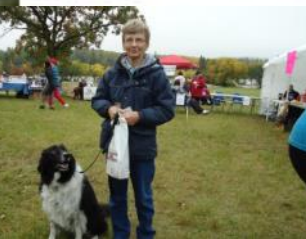
They come every year for a great cause