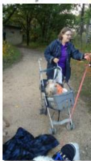
We made it!