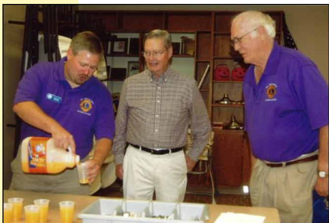
St. Hilaire Lions working hard.