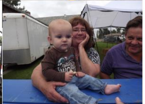
Pancake Breakfast Here is where Powered By Pancakes recharges!