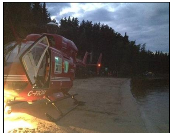
Black Lake, Manitoba August long weekend, 2012, Evening mission