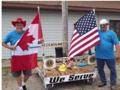
5M11 International Race Team POWERED BY PANCAKES