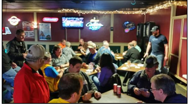
Picture of the group of players at the Warren Lions Pinochle Tournament held at Mick's on Saturday, 3-26-16.