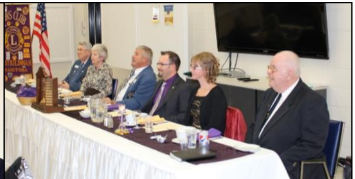
Head table at the East Kildonan 60th anniversary celebration.