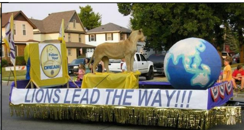
Crookston Ox Cart Days