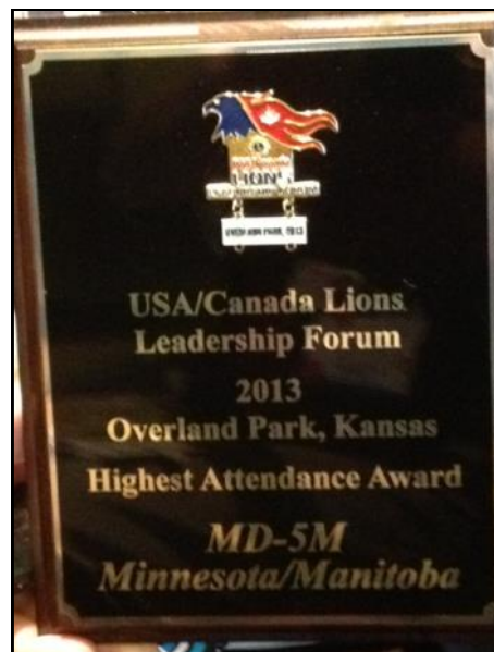
Award the District received at the USA/Canada Forum.