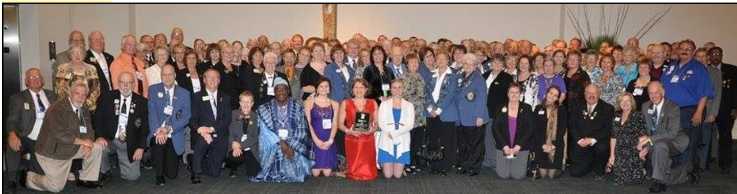
Multiple District 5M 's contingent of 140 Lions at the USA/Canada Forum in Overland Park, Kansas.