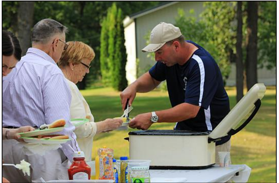
Just hold out your plate for a great meal!