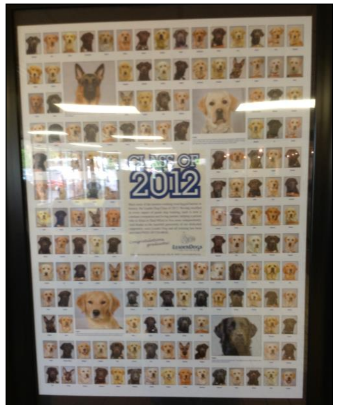
Graduates of the 2012 Leader Dog