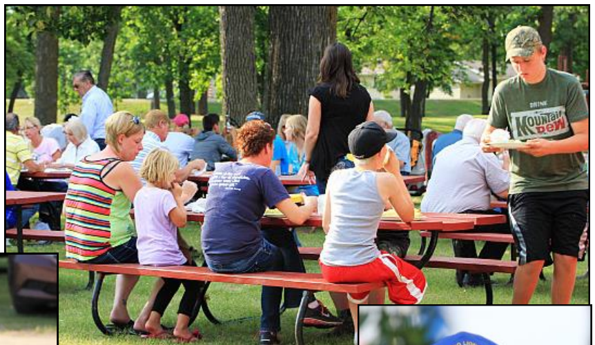
Always more room at the tables!