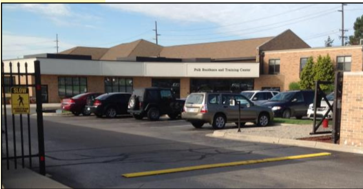
Residence and training center