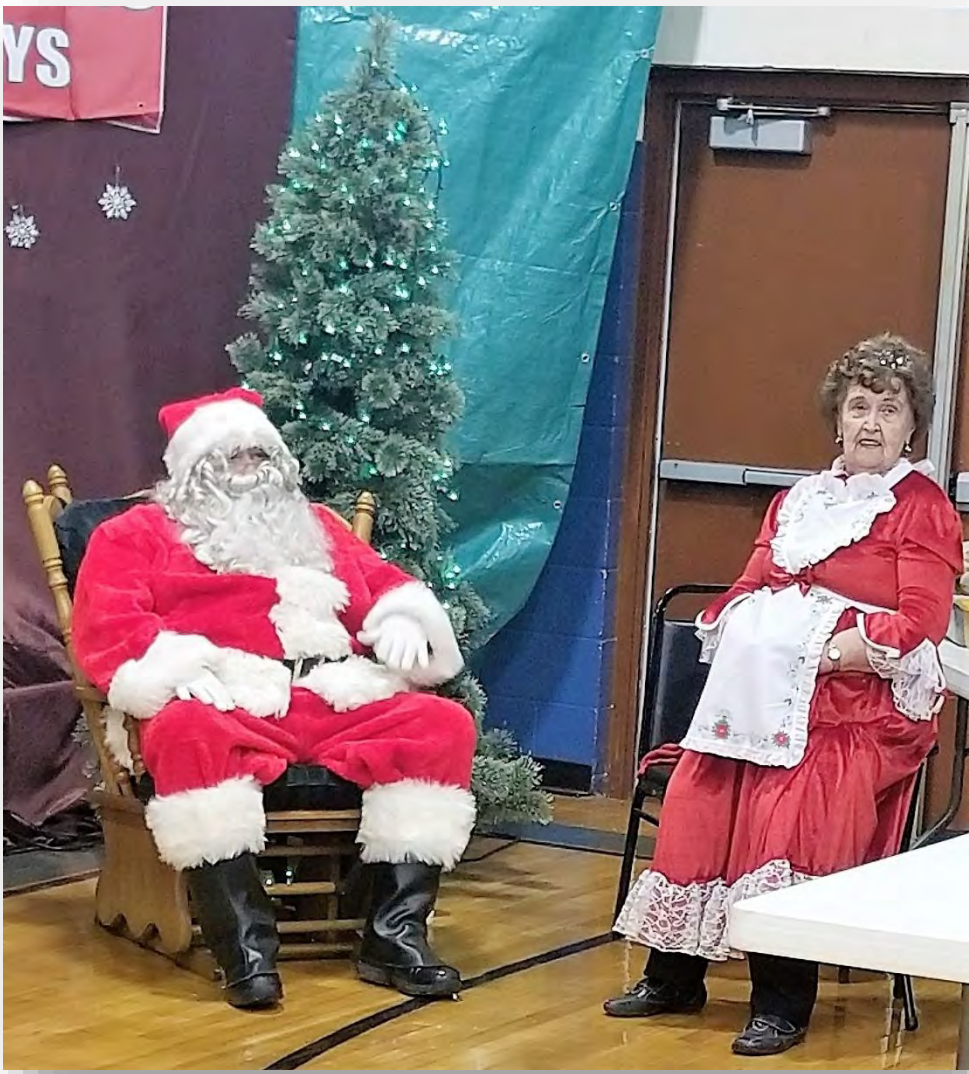
Hitterdal Lions and the community put on Santa Claus Day at the Community Center on December 7 th , 2019.