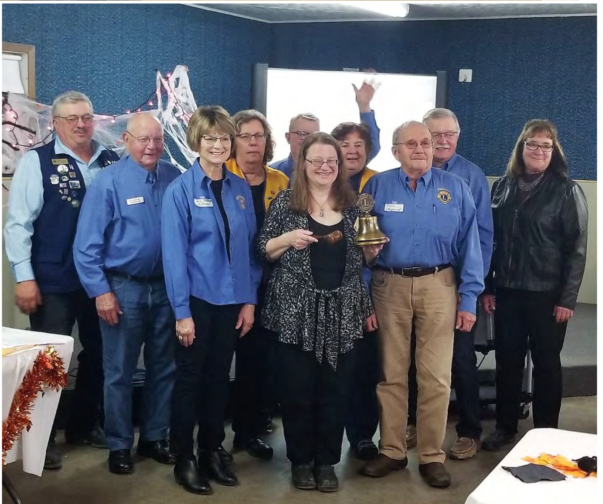
Hitterdal Lions sponsoring the new club