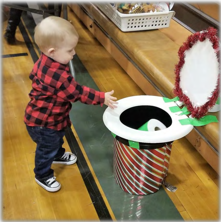
Area kids enjoyed visiting with Santa and Mrs. Claus and had fun playing games.