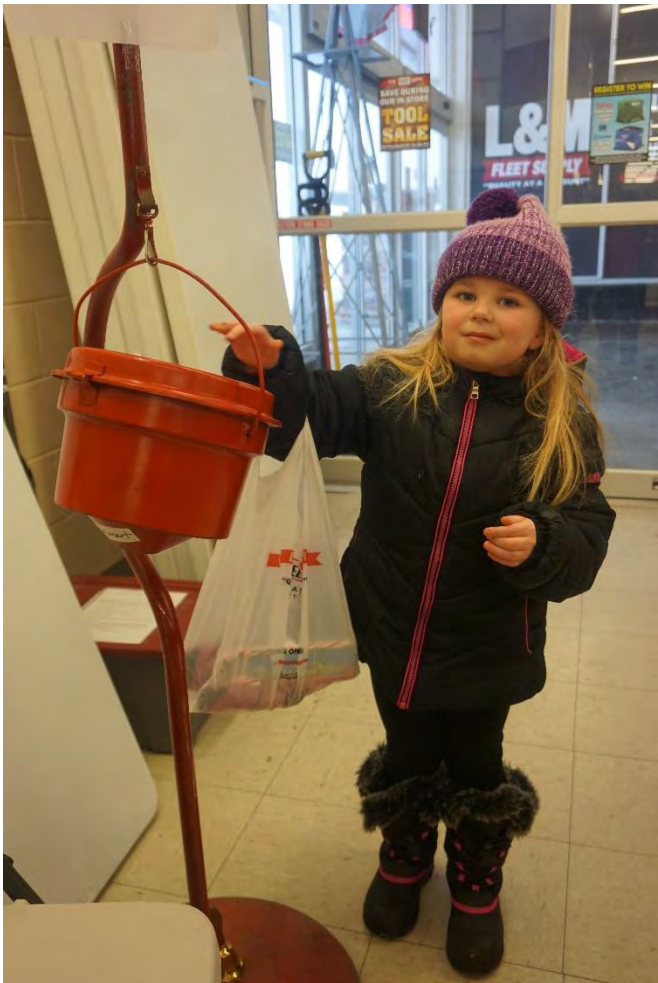
A little cutie delighted to donate at L & M Fleet in Thief River Falls, MN.