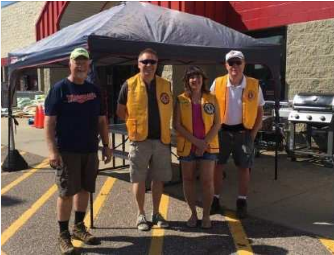
Sleepy Eye Lions ran a Brat Stand Project at a grocery store to raise funds for Student Scholarships.