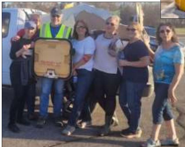
Left: The Redwood Falls Lions participated in their annual ditch clean-up on Monday, April 21 st .