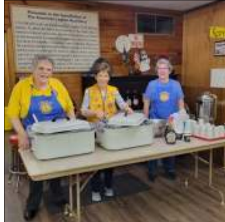
Left and below: Lakefield Lions Pancake Breakfast was a success for the community on Palm Sunday.