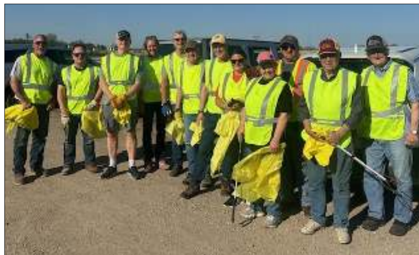
The Granite Falls Lions pose for a photo during ditch cleanup for the Adopt A Highway program.