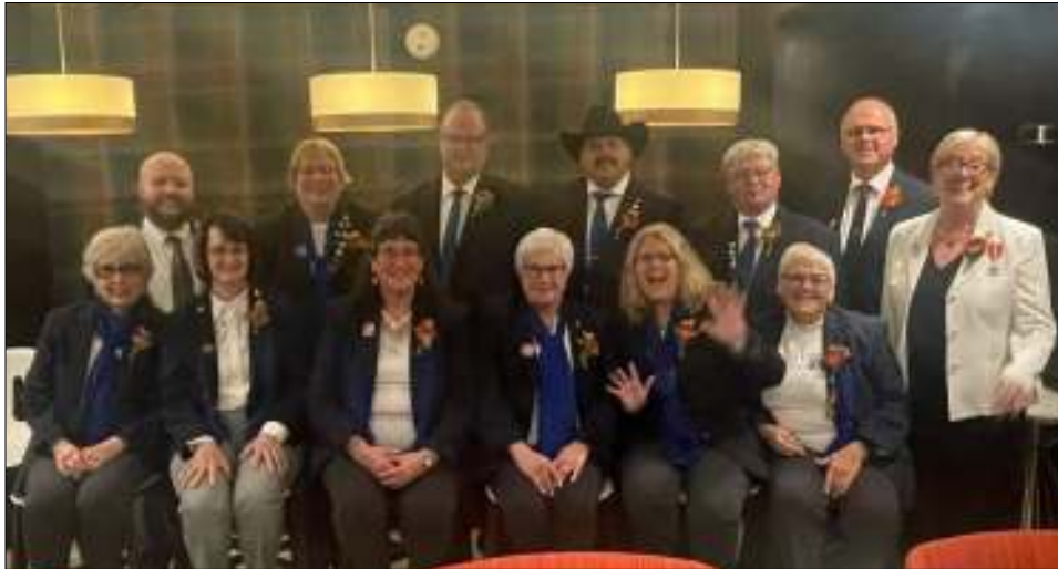
Left: 1VDG's of MD5M