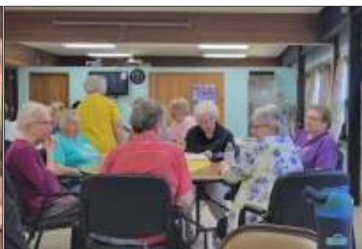
They also served walking tacos to raise money for the Lions Hearing Foundation.