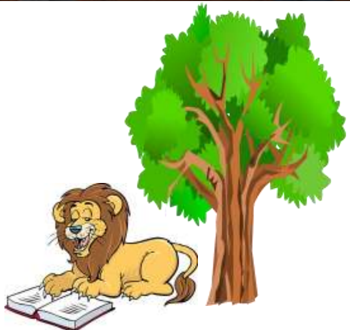
Pic 4) Redwood Falls Lions donated $1,500 to Reforest Redwood Falls. This money will go towards planting new trees in the dog park where trees were cut down due to Emerald Ash Borer.