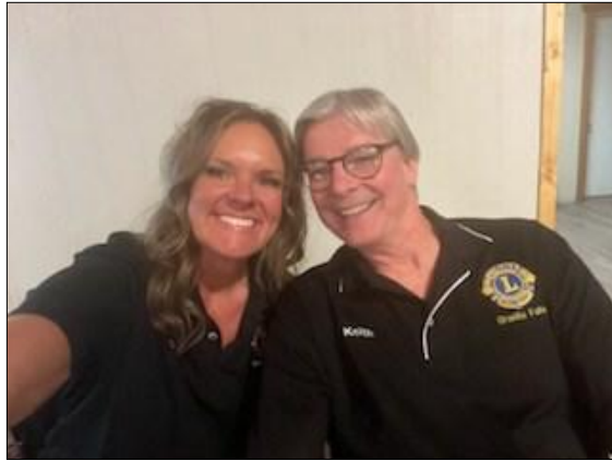
Granite Falls Lions Annual Ole and Lena Buck tournament.