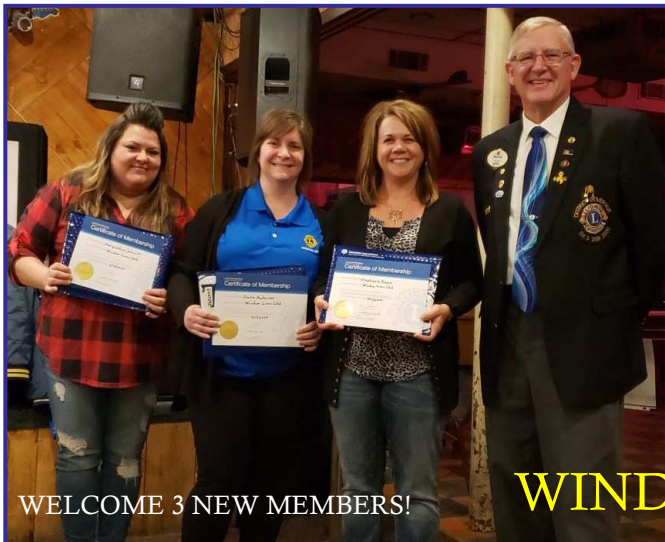
WELCOME 3 NEW MEMBERS!