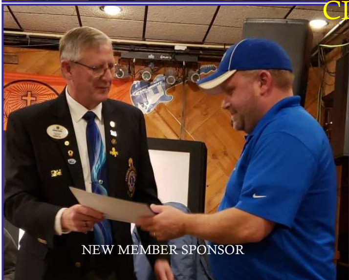
NEW MEMBER SPONSOR