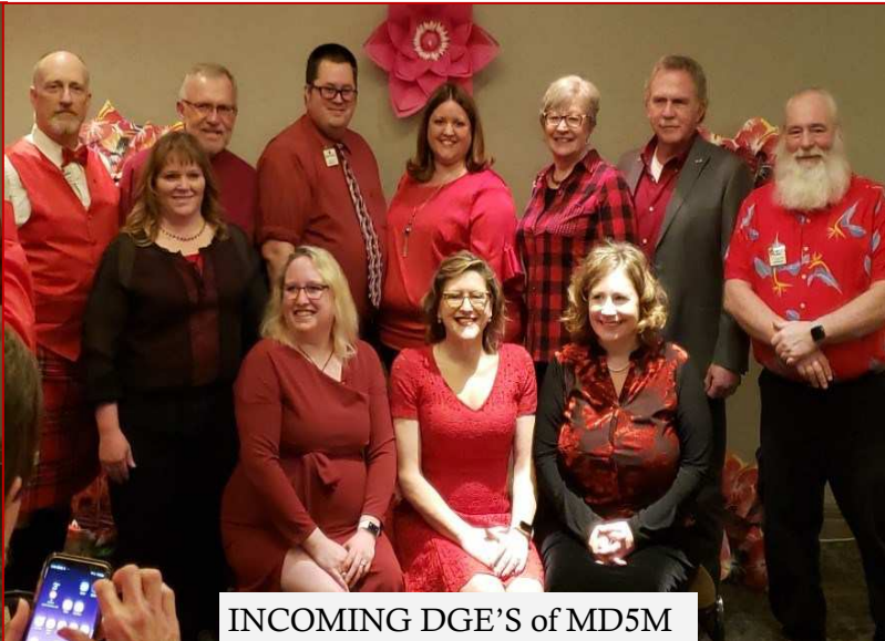
INCOMING DGE'S of MD5M