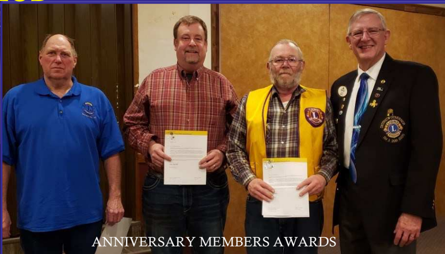
ANNIVERSARY MEMBERS AWARDS