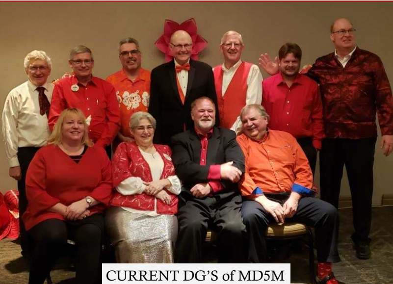
CURRENT DG'S of MD5M