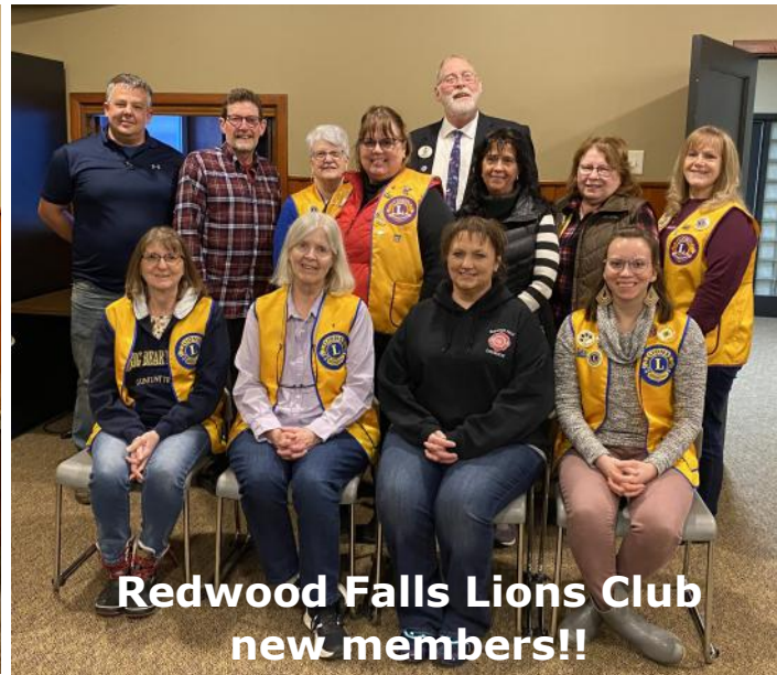
Redwood Falls Lions Club new members!!