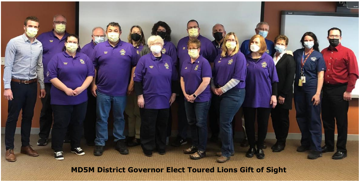
MD5M District Governor Elect Toured Lions Gift of Sight