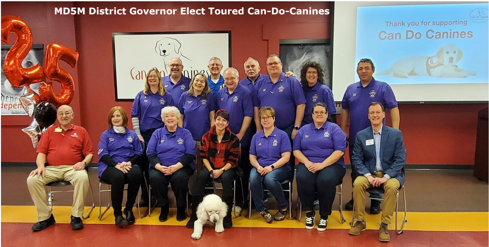
MD5M District Governor Elect Toured Can-Do-Canines