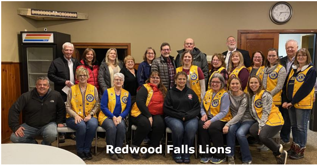
Redwood Falls Lions