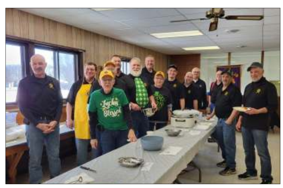
Above: Lucan Lions serve breakfast at the St. Patrick's Day celebration on Sunday, March 16, 2025.