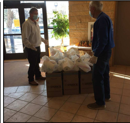
Tracy Lions Club packaged 50 Thanksgiving food boxes for distribution.