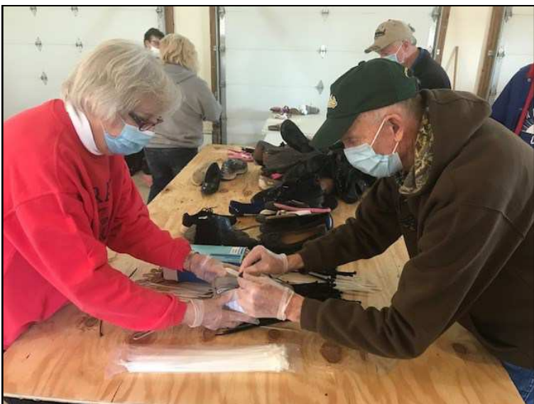
Tracy Lions Club collected and put together over 900 pairs of shoe for Soles4Soles.