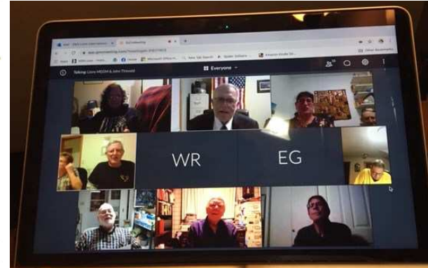
The planning committee shares ideas for the Mid-winter Convention.