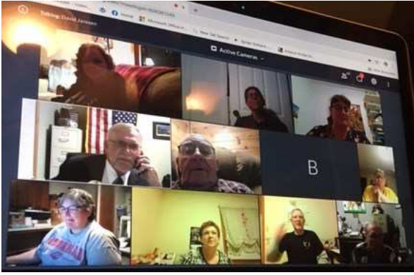
5M3 Cabinet members held a virtual GoTo meeting in October.