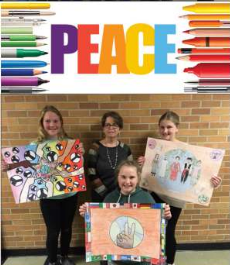
Above: Hadley Lions Peace Poster 1st, 2nd and 3rd place winners

from Murray County Central Elementary in Slayton,