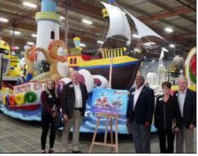
First look at 2022 Lions Club International Rose Bowl Parade float. Flowers to be added later. celebrate with us!