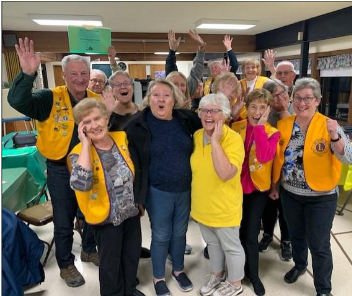
Lakefield Lions Governors Visit