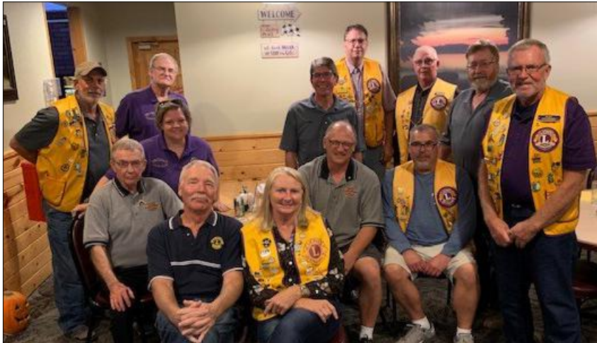
Zone 6 held their meeting on Nov. 3rd