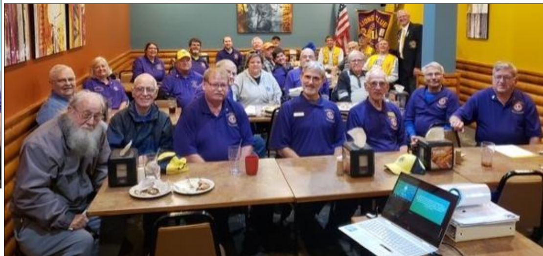
Fairmont with Sherburn and Truman Lions Clubs