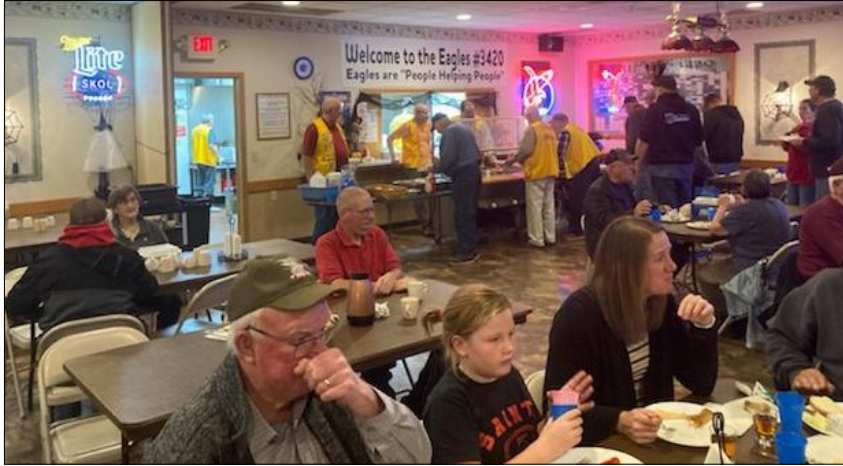
The St James Lions Club had a well-attended fish fry on Mon, Oct. 24 to raise funds for their "Youth Eye Care" signature project.