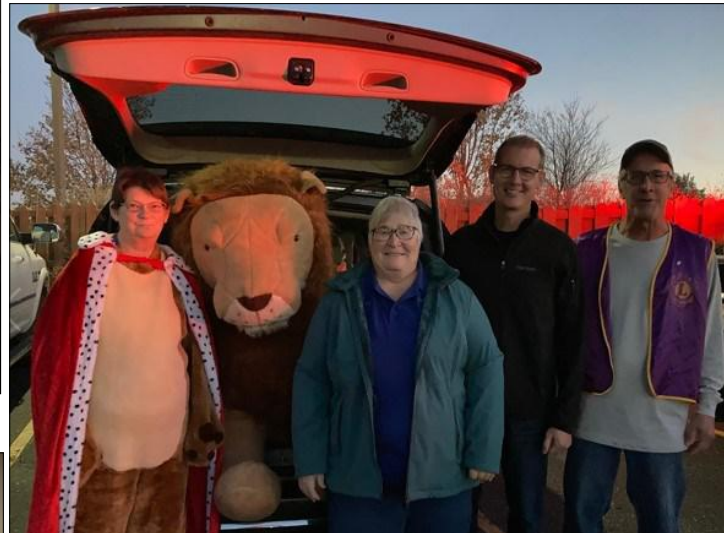
Tracy Lions Truck or Treat