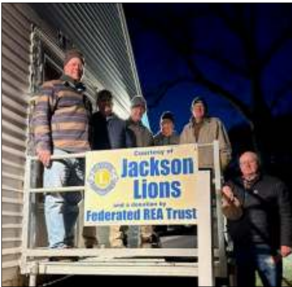
Jackson Lions served the community again by placing 117th ramp (above) and 118th ramp (below).