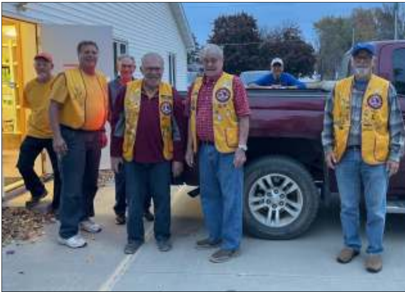
Sherburn Lions helped fill the food shelves in Sherburn and Dunnell. Heavens Table Food Shelves in Sherburn received some needed items and Dunnell Food Pantry also received a lot of items they needed.