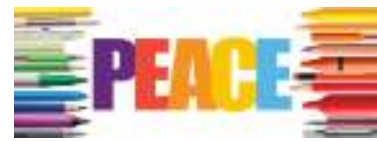
Sleepy Eye Peace Poster contest winners.