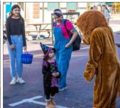
The Redwood Falls Lions participated in the annual "Monsters on Main" on Saturday Oct 26 in downtown Redwood Falls. Kids enjoyed games and treats while their famous Lion had a blast with the youngsters.