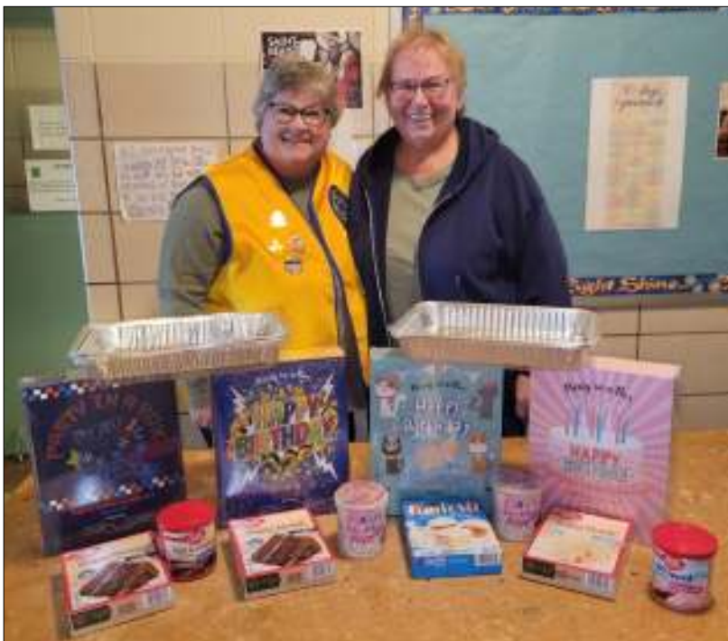
Birthday boxes from the Lakefield Lions