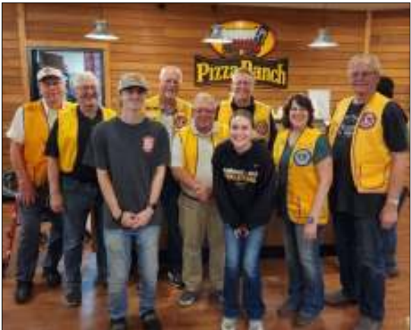
Sleepy Eye Lions bussed tables at the New Ulm Pizza Ranch to make money for Lions projects.