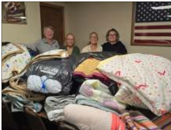
Springfield Zion Lutheran quilters donated 35 quilts to Project Tuck Them In.