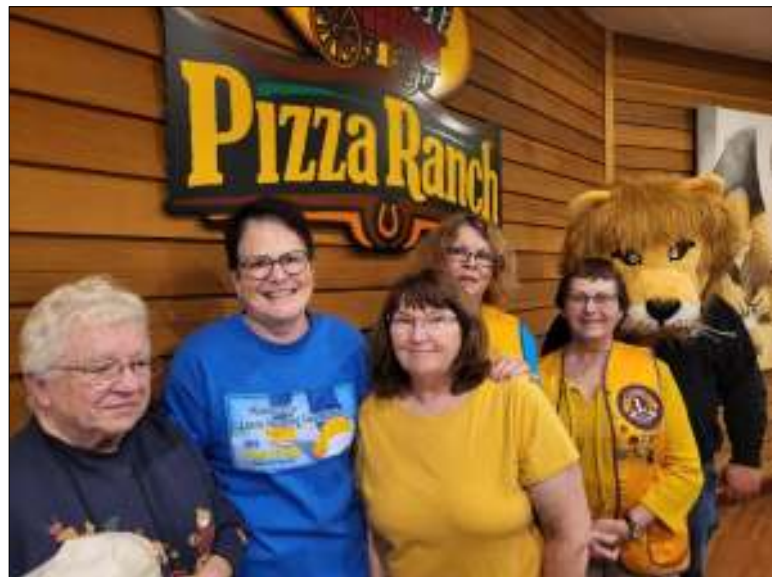
New Ulm Pizza Ranch Tip Night Fund Raiser