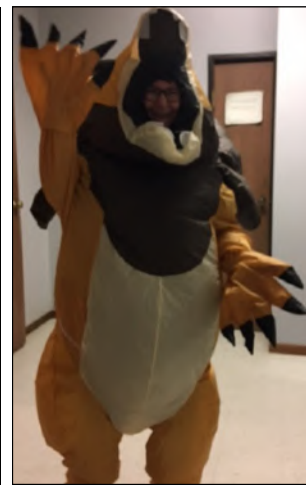
Hadley Lions chili challenge took place in January with 8 teams competing. Proceeds went to local family with medical expenses.