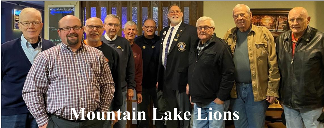
Mountain Lake Lions