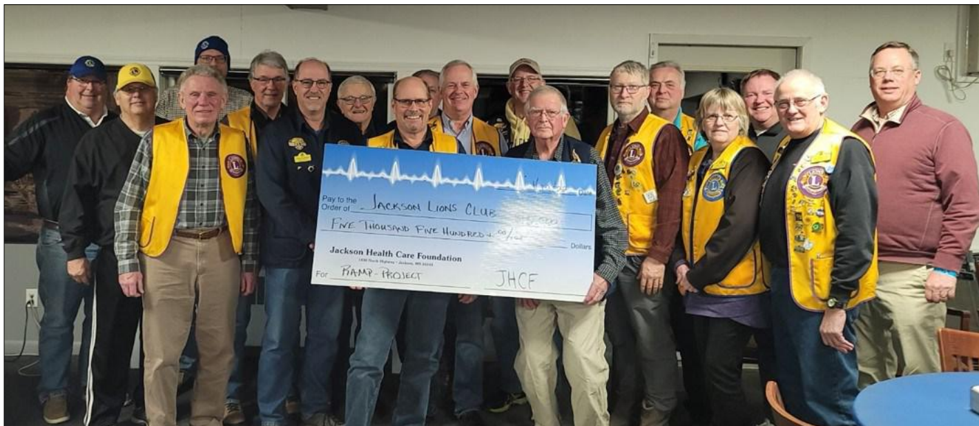
Jackson Lions Club received $5,500 donation from Jackson Healthcare Foundation for use in their wheelchair program.