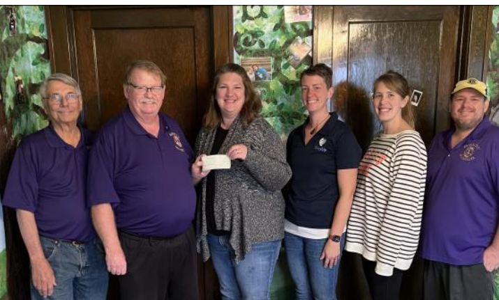
Left: Fairmont Lions present $1000 to Fairmont area Kinship.