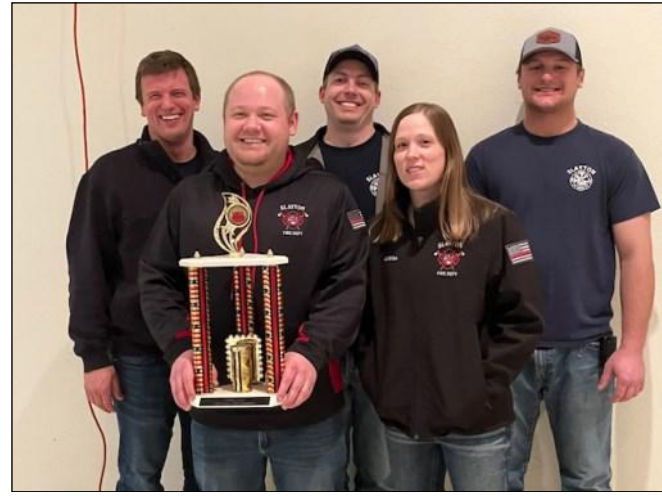
Above: Slayton Fire Department had the winning chili for second year. Below: 8 teams made chilis for the fundraiser.