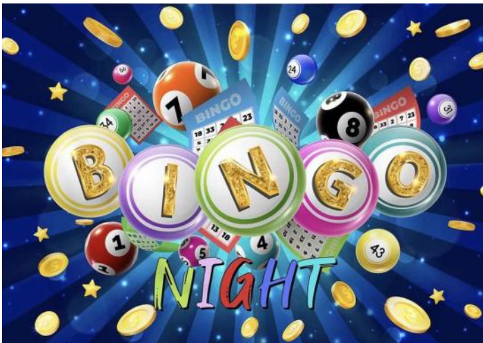
Hadley Lions have begun serving food during Currie Town & Country Boosters Bingo on Friday evenings, January-March. Right: It is well attended.