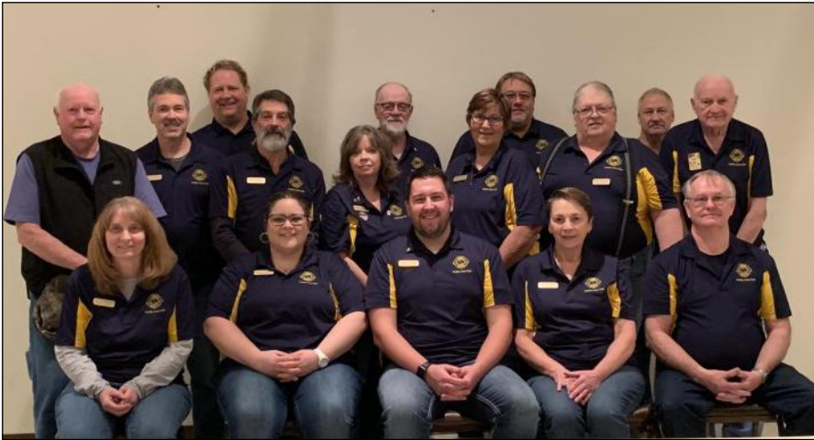
Hadley Lions and helpers at annual Chili Challenge. Proceeds went to local family for medical expenses. Over 300 people were served. Below: Recipient family gave Hadley Lions appreciation plaque.