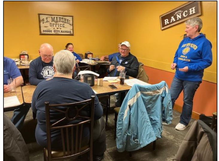
5M3 Mid-Winter planning committee held the final meeting at Slayton's Pizza Ranch.