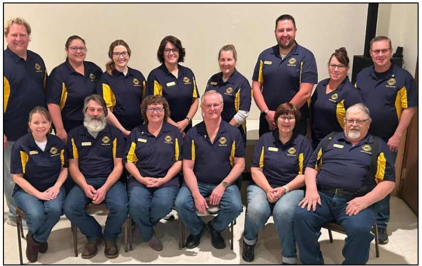
Hadley Lions pose for a photo before serving +250 people during the annual chili challenge on Jan. 3.