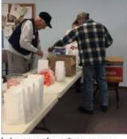
Santa visited Hadley and handed out treat bags that were assembled by members of the Hadley Lions Club . Those as young as 2 weeks old told Santa their Christmas wishes. Extra treat bags were delivered to area daycares.