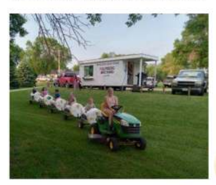
Lucan Lions Beef Barbecue.

To the Sion's Club from District 5M3, Wow ! What an amazing donation from your organization. The fluce blankets and pillowcases are the perfect gift for our pediatric patients that they can use immediately when hospitalized What a comfort and day brightener at what can be a scary time out of their some setting. The bright colors and designs are 30 friendly, cuddly, and welcoming for all our age children. All your preparation in buying, sewing, tying, folding, washing, adding individual cards, packing and delivering is apparent of how much love went into this marrelous project. Thank you on behalf of all the future pediatric patient recipients of the blankets + pillowcases along with their parents and the staff at Sanford Children's Hospital. We are