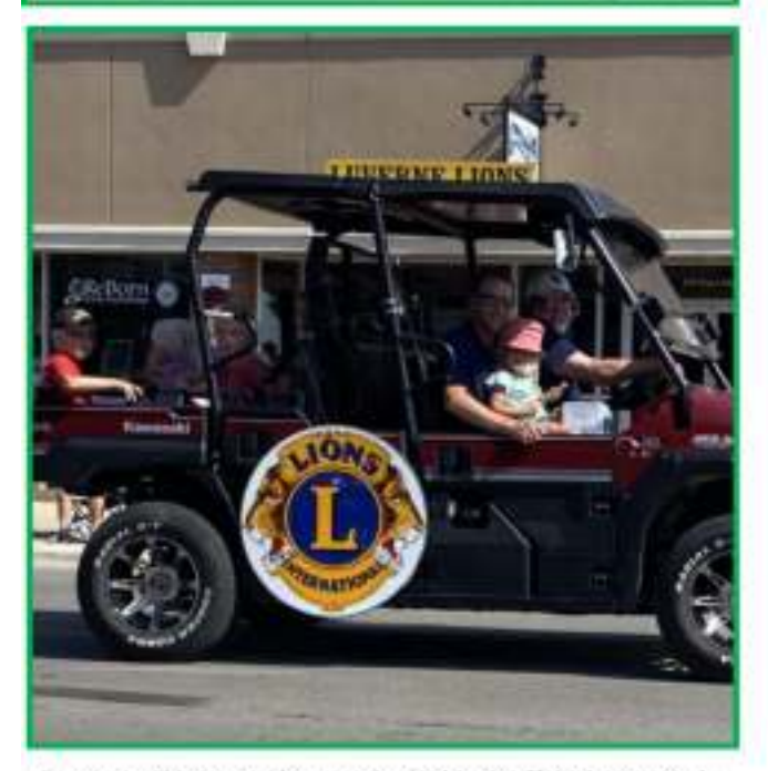
Luverne Lions tossing candy during Buffalo Day parade.