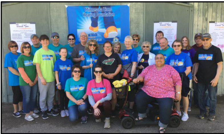
New Ulm Lions Walk to D-Feet Children's Hearing Loss

Twenty Three New Ulm Lions and friends participated in the 13th annual Lions "D-Feet Children's Hearing Loss Walk" on Saturday, June 1st, 2024 at the University of Minnesota Landscape Arboretum in Chaska MN. The goal is to raise $100,000 for the Lions Children's Hearing Center at the University of Minnesota. The Lions Club of New Ulm donated $1,500 to this event. This event was sponsored by the Lions Multiple District 5M Hearing Foundation.