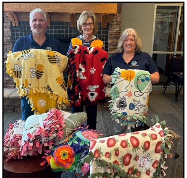
Right: Luverne Lions delivered blankets to their local hospital.