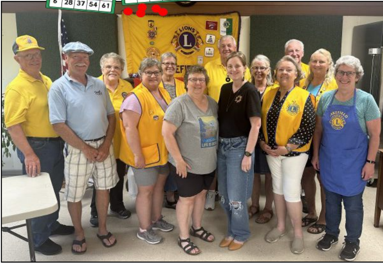
Lakefield Lions (above & right) raised $220 for the SW Crisis Center during their Town Summerfest celebration with a community BINGO night.