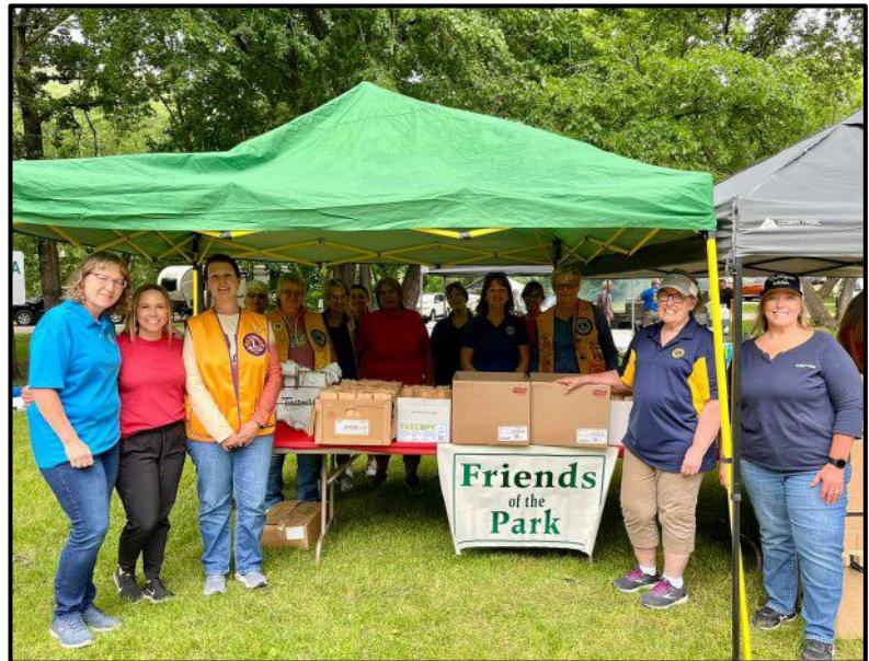
Above: On Wednesday, June 5 th the Redwood Falls Lions helped at the "Friends of the Park" Jamboree. The fundraiser was a Drive-Thru Park Picnic Dinner at Ramsey Park in Redwood Falls.