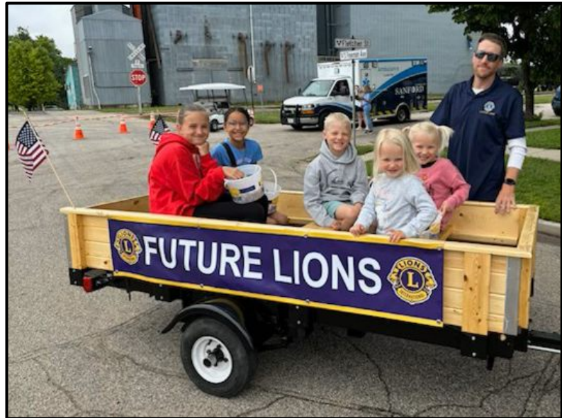
Buffalo Days parade in Luverne.