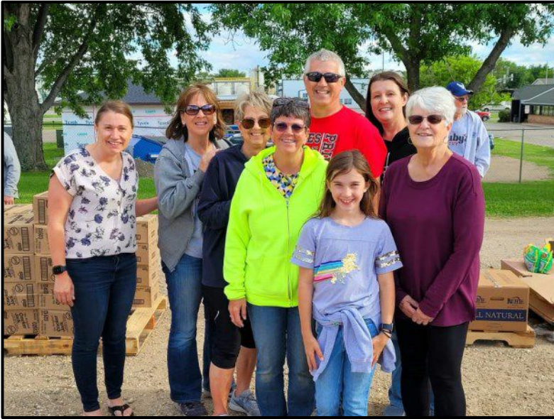
On May 28 Redwood Falls Lions volunteered to help the community's Ruby's Pantry. The organization distributes food to families in need at a reduced cost. Over 200 families were served that evening.