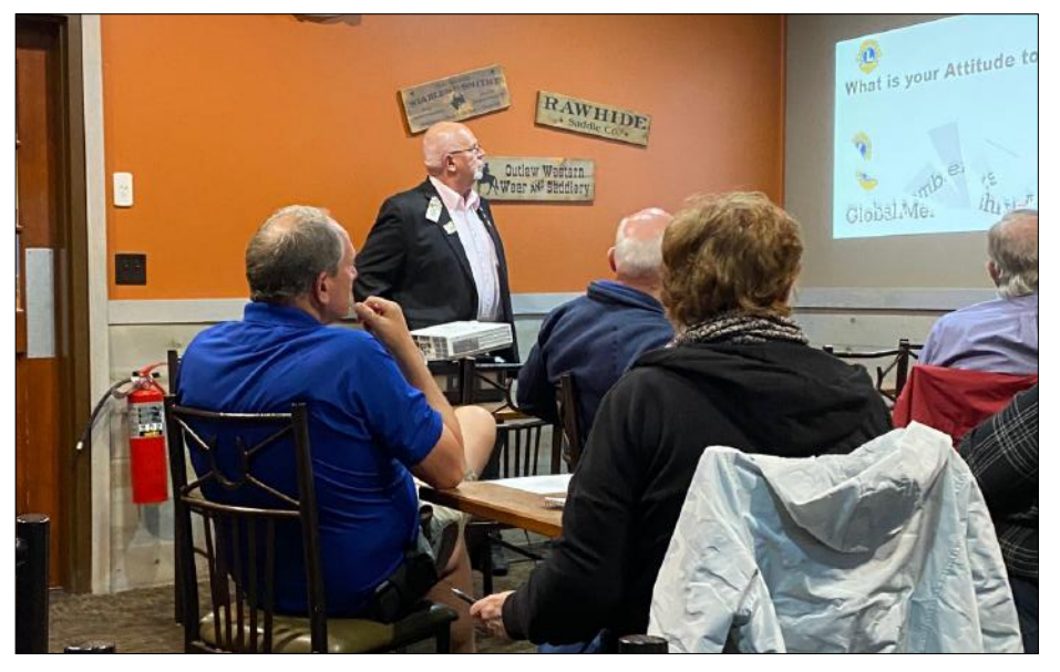
Above and Below: Zones 1 & 2 Joint Meeting