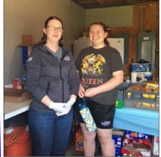
Several members of the Slayton Ambulance and other helpers assisted Lions at ball tournament. Proceeds from event were give to the Ambulance Association for new equipment