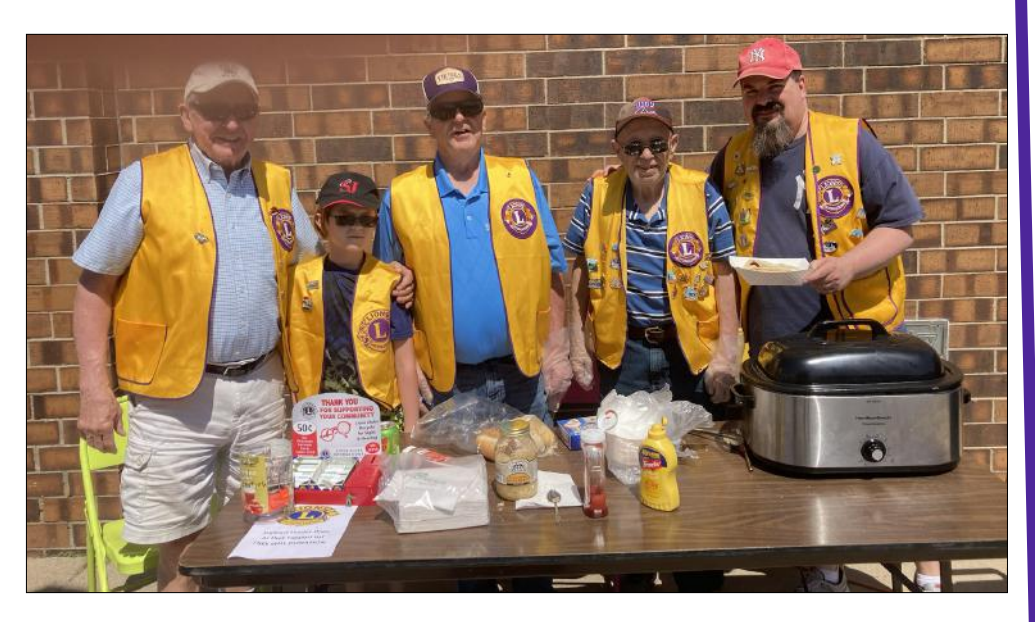
St. James Lions working at St. James Hot Dog Days May 14