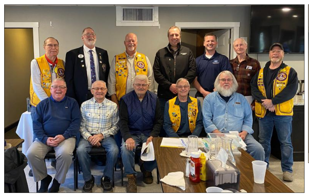
Sleepy Eye Lions