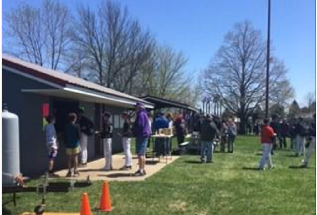
Hadley Lions annual Jr. High baseball tournament was held May 14