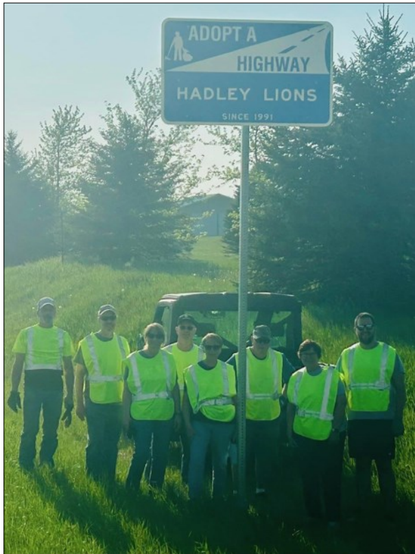
Hadley Lions had a busy week with their annual jr. high baseball tournament (right) and ditch cleanup (above). Proceeds from the baseball tourney went to two local families for medical expenses.