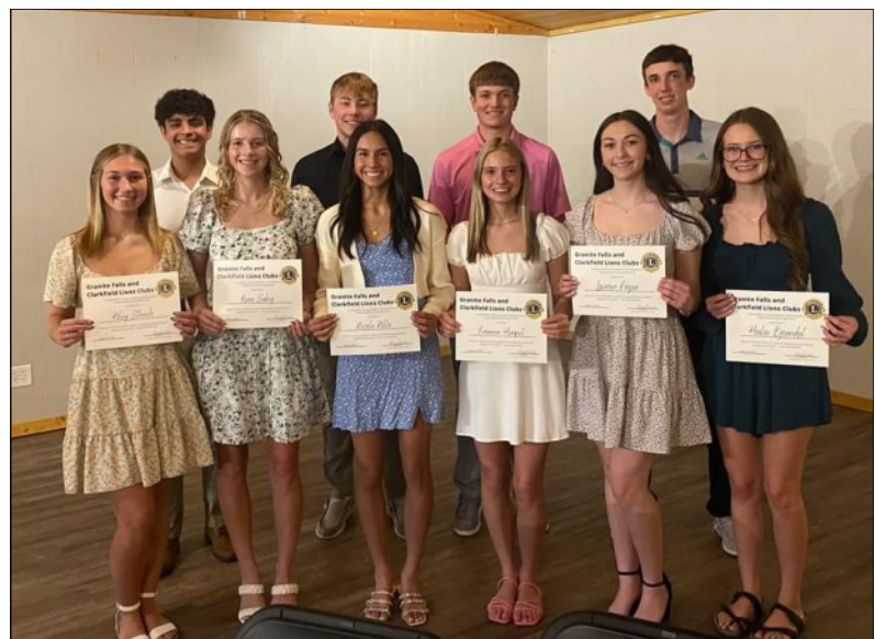
On May 1st the Granite Falls Lions and Clarkfield Lions honored the top Seniors of Yellow Medicine East high school.