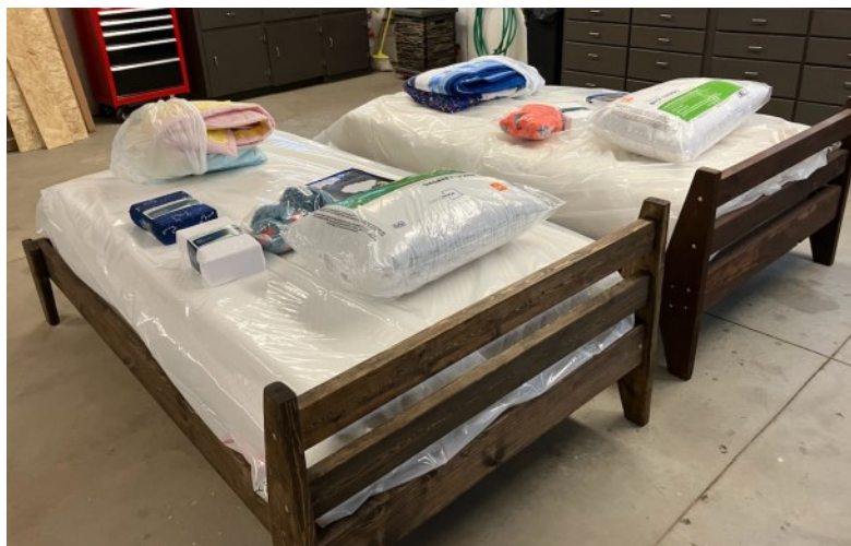
Sherburn Lions are making youth size beds for children who need beds. The project is going well and they have delivered ten beds in the area. The community has been very supportive with donations of mattresses and comforter's from a local church. Thanks for all the donations and great job Sherburn Lions.