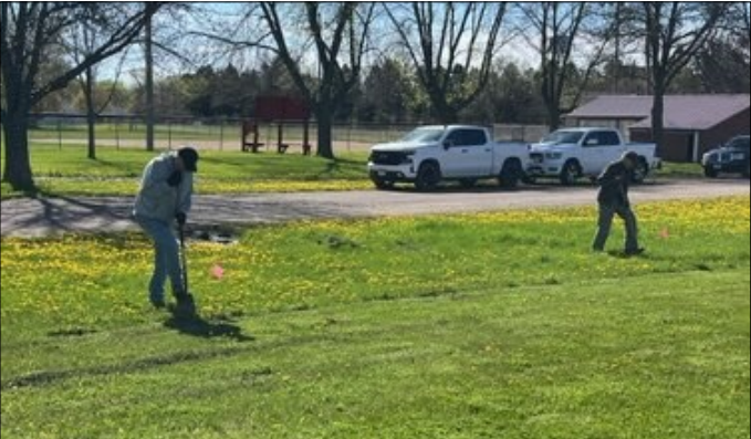
Above and Right: Clarkfield Lions planting trees.