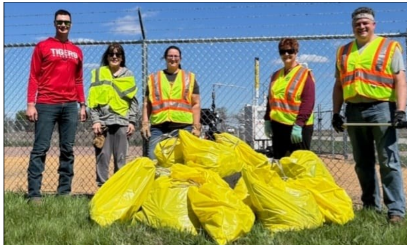
Springfield Area Lions and Rotary Club of Springfield picked up garbage for the Adopt A Highway Program.