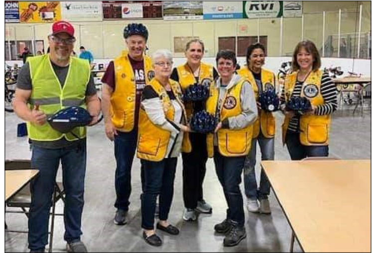
Redwood Falls Lions participated in the CentraCare's Community Bike Rodeo on Tuesday, May 30 th at the Redwood Area Community Center. The group helped with fitting new bike helmets for all the kids that participated, checking over bikes to make sure they are in safe-mode and helping in the bike obstacle that was set up for the kids to ride their bikes through.