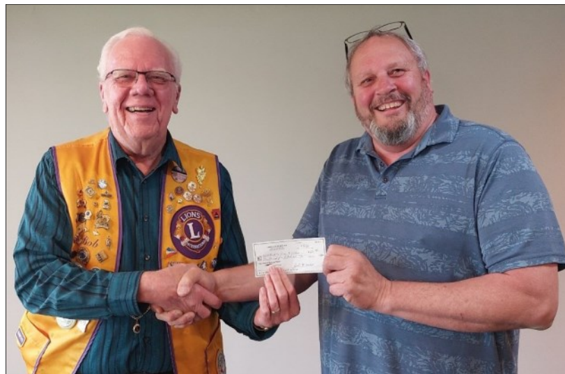
The Lions Club of New Ulm has donated $1500 to Heart to Home Furnishings. Heart to Home Furnishings is a nonprofit, tax exempt, organization that provides used furniture and household items to needy families in the New Ulm area. Referrals are taken from approved community service and crisis agencies. You can donate your gently used furniture and household items or monetary gifts by calling 507-276-6228 or by emailing hthfurnishings@gmail.com .