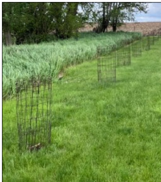
Above and right: Hadley Lions planting trees on south edge of Hadley.