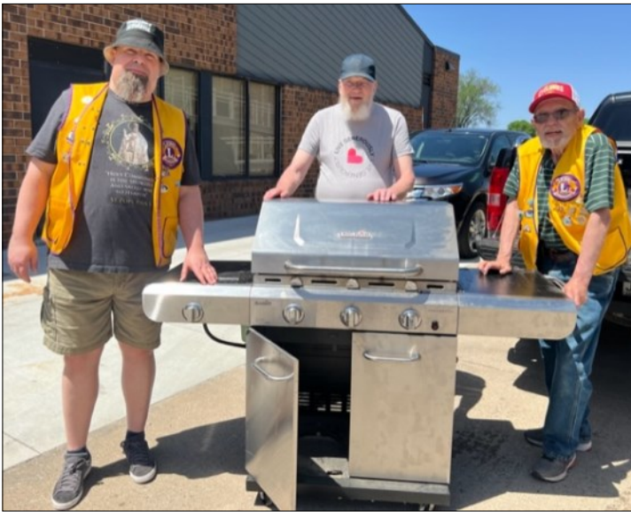
St. James Lions working at Hot Dog Days in St. James