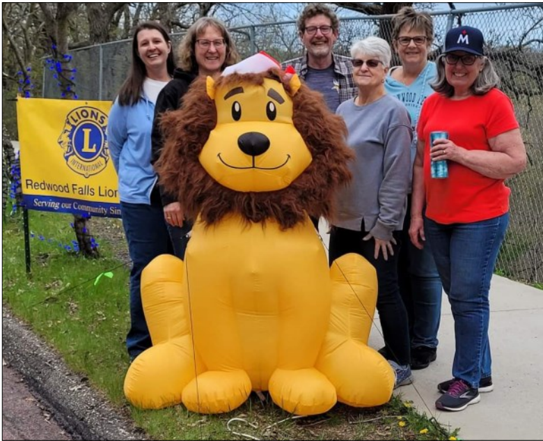
Redwood Falls Lions participated in the "Celebrate Redwood Falls Night Falls held May 2-4 th at Redwood Falls Ramsey Park. Their group put a lighted section in the park and some members volunteered helping out with pedestrian crosswalk areas, parking entry/exit areas, etc.