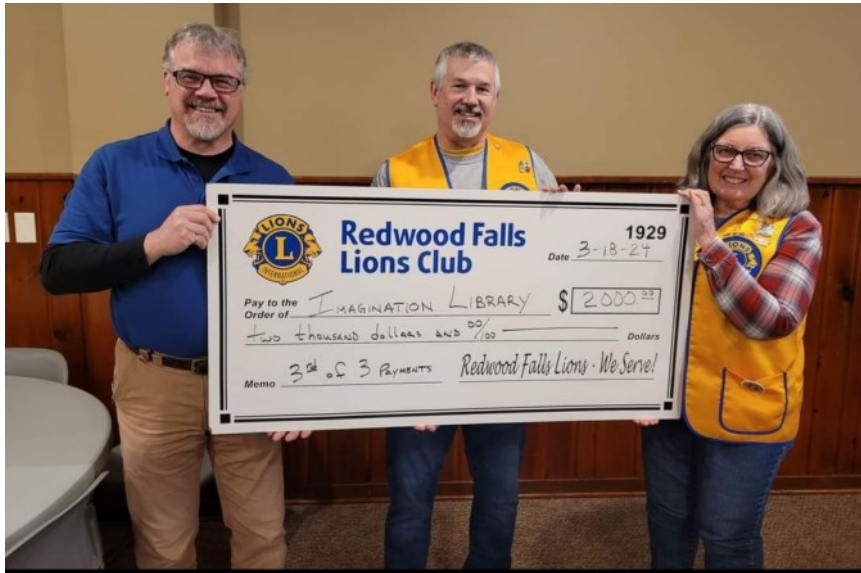
Redwood County's "Imagination Library" received $2,000 from the Redwood Falls Lions on 3/18/24.