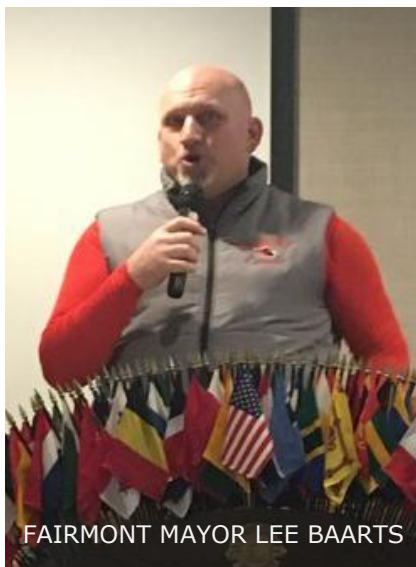
FAIRMONT MAYOR LEE BAARTS