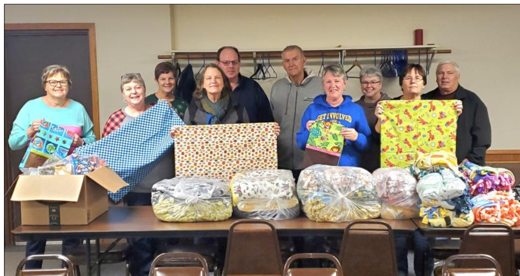
Springfield Area Lions tied 20 blankets and sewed 58 pillowcases for Childhood Cancer.