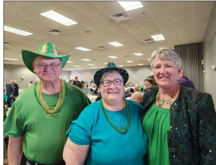
Enjoying the LCIF Gala Paint the Town Green.

Lions International Convention | Melbourne, Australia | June 21-25, 2024