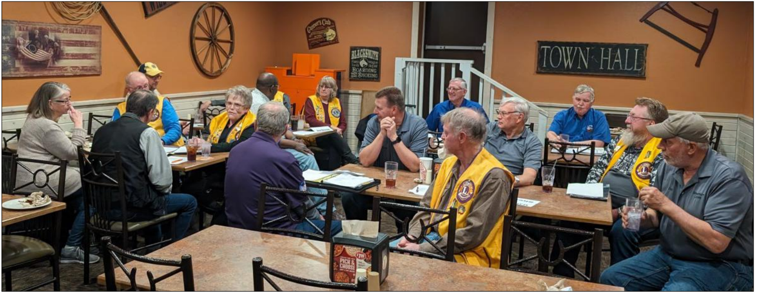
Above: Zone 7 meeting took place April 4 at Jackson Pizza Ranch. Below: Zones 3 & 4 gathered at Slayton Pizza Ranch April 11.