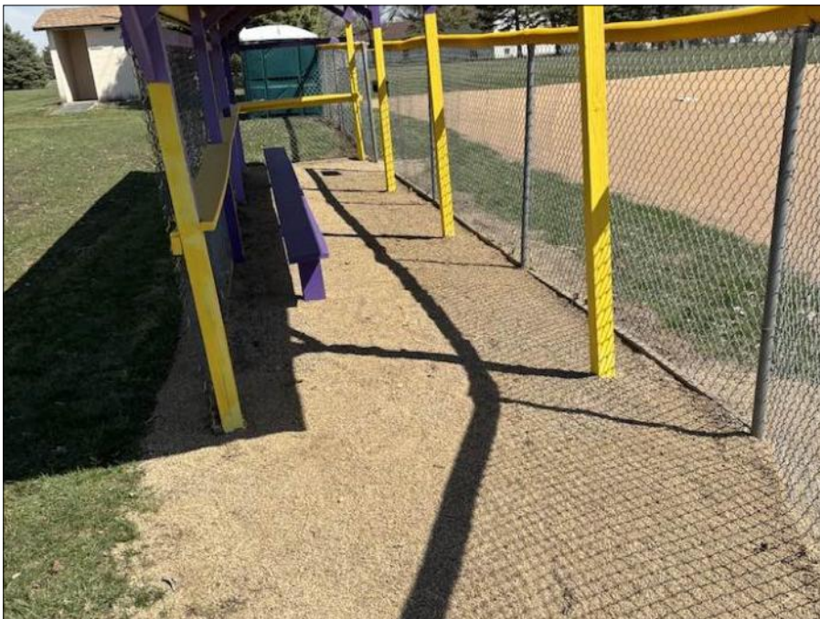
Above and Left: Jasper Lions spread Agri-lime on two softball fields, put pea rock in dugouts and around the concession stands.