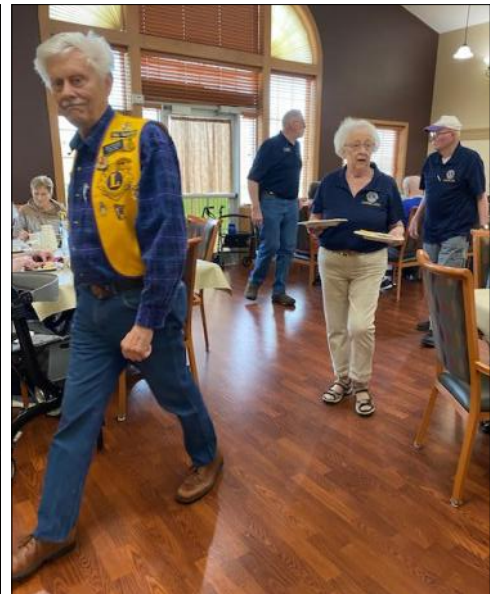
Luverne Lions served pancakes to a hungry community.