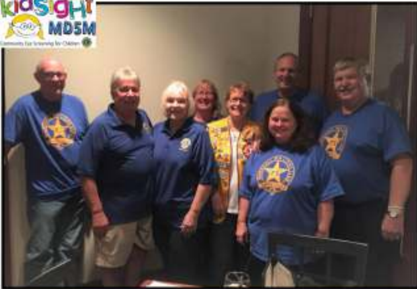
Left: Marshall Lions screened students for Kid-Sight in September, over 1,233 so far this fall. Over 150 volunteer hours.