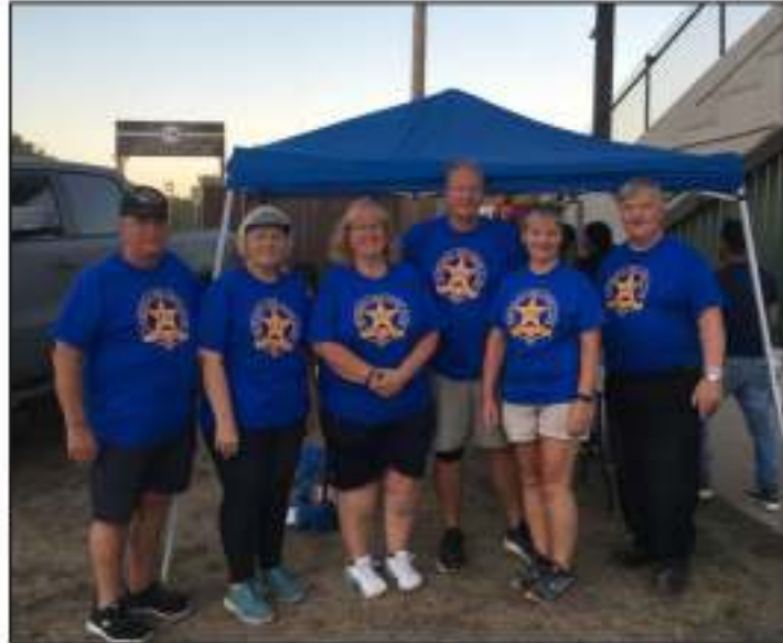
Above: A group of Marshall Lions took tickets at the Lyon County Fair for two nights.