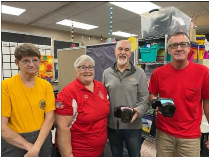
Tracy Lions held KidSight Screening

The 9th Annual New Ulm Diabetes Walk to find a CURE took place at Flandrau State Park on Saturday, September 30th. This was a Strides, Lions for Diabetes Awareness Event and is a collaboration of the Lions Club of New Ulm and the Lafayette Area Lions Club. This was an approximately a half mile walk on Flandrau park's beautiful trails. It is a Fund Raiser for the Minnesota Lions Diabetes Foundation, who is working with the University of Minnesota to find a CURE for Diabetes. Over $17,000 was raised.