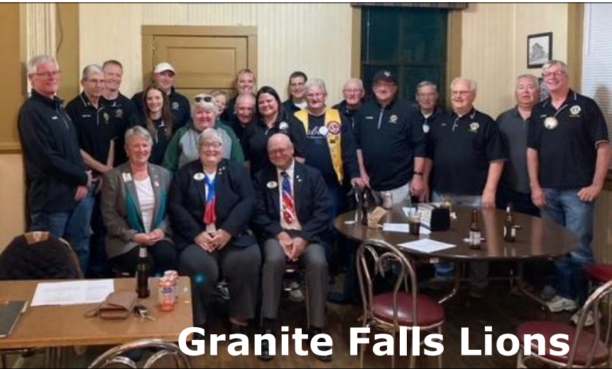
Granite Falls Lions