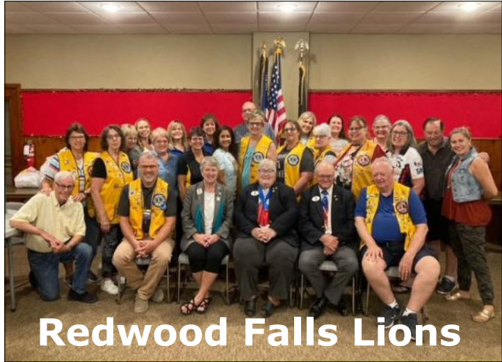
Redwood Falls Lions