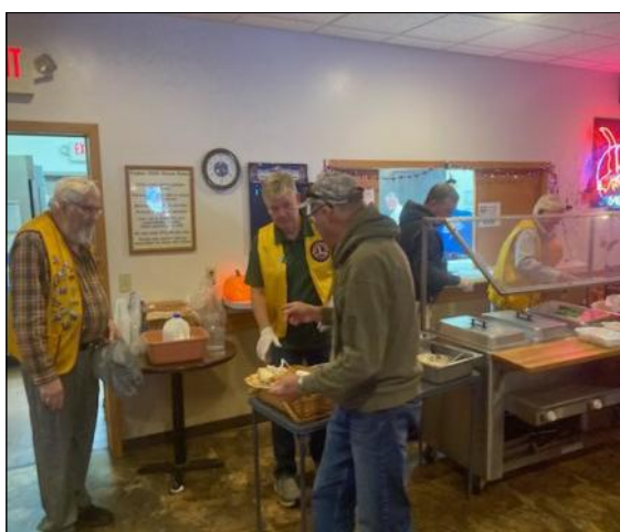
Above: There was a great out at the St. James Lions fish fry, which was held on October 16.