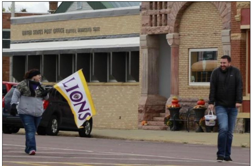
Hadley Lions walked/handed out candy during Murray County Central's homecoming parade on a brisk day.