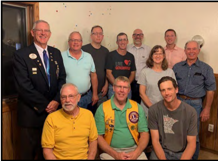
ST. JAMES LIONS