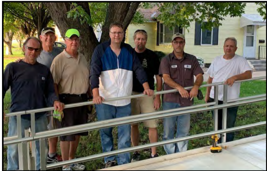
Jackson Lions finishing another wheel chair ramp deployment.