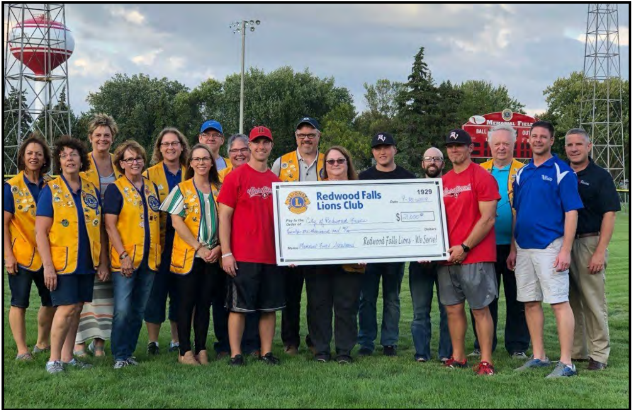
The Redwood Falls Lions were able to pay off 2 years early their commitment for a new Daktronics scoreboard at Memorial Field ball park through their 300 Club raffle fundraiser.