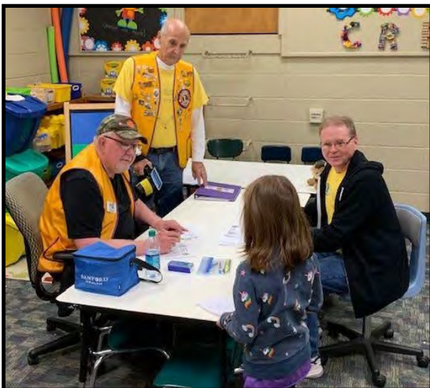
Members of the Jasper Lions club have screened 423 Pipestone Area School students ages Preschool through 10th grade.