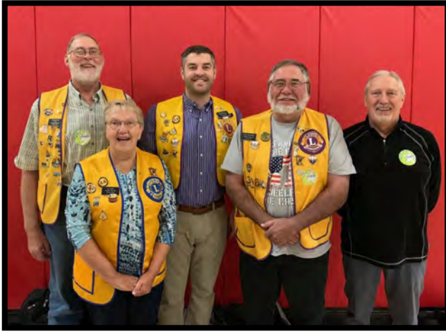
The 'Luverne Crew" worked Kidsight screening at the Luverne Elementary School. 505 kids were screened in two days.