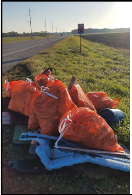
While you can't see that the sign says "scenic route" (because the beautiful sun is shining!), it did get a whole lot more scenic AFTER 14 Redwood Falls Lions and one helper picked up all this trash! You're welcome.