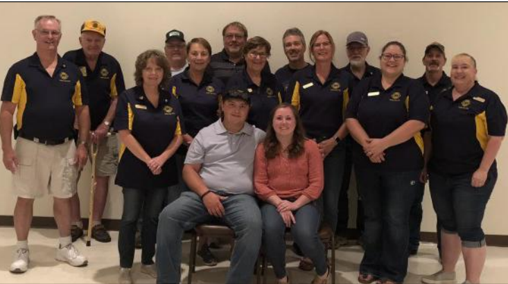
Hadley Lions Club (above) held a fundraiser for a couple whose newborn infant is on NICU in Sioux Falls. Over 340 people were served beer/pork burgers, hot dogs and brats from Murray County Beef Assoc and Murray County Pork Producers. (below)