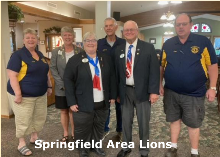
Springfield Area Lions