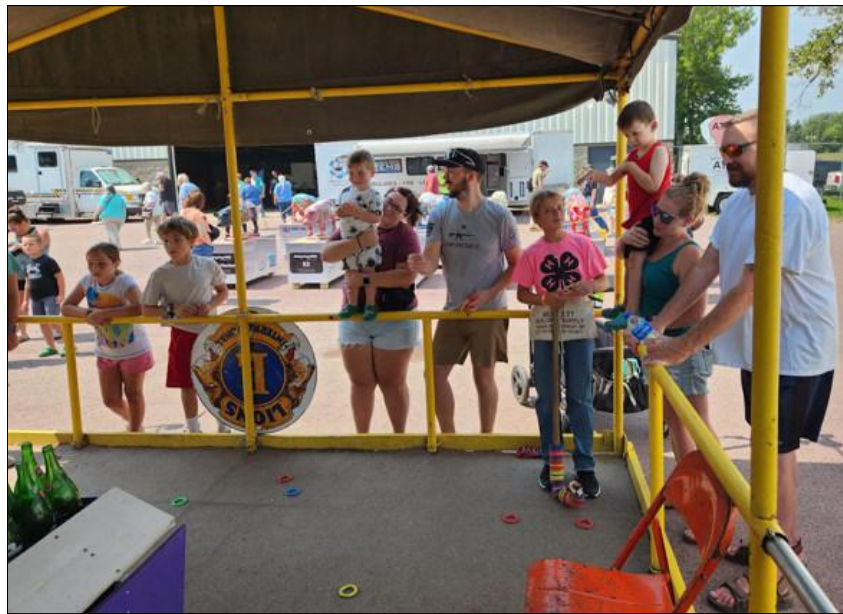
Lions had a great time @ the Martin County Fair manning the Ring Toss!