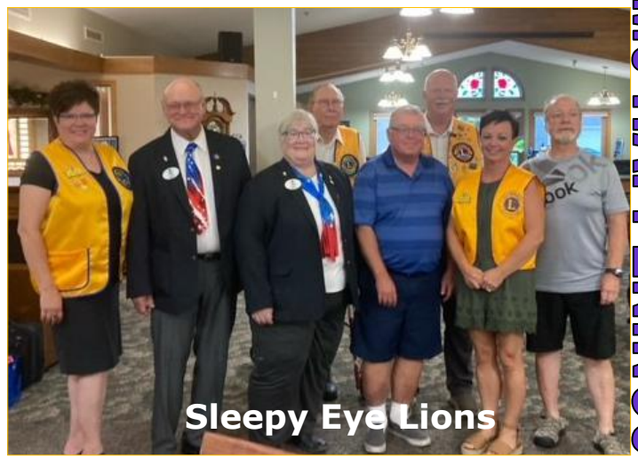
Sleepy Eye Lions