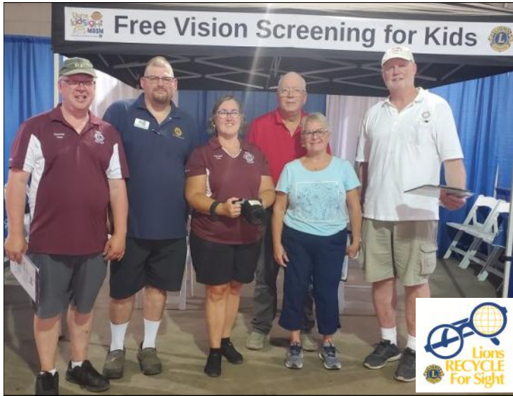
5M3 & 5M5 Lions doing kids sight at Minnesota State Fair Sunday September 3