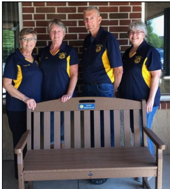
Springfield Area Lions donated their first NexTrex bench to St. Johns Circle of Care. This was the product of collecting 600 pounds of recyclable from the community.