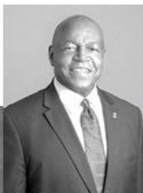
First Vice President