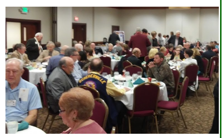
Saturday evening Banquet crowd at Convention