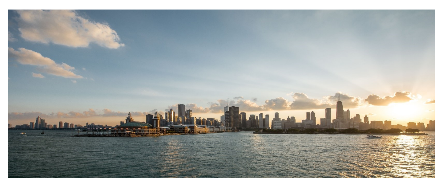
Lions International Convention and 100th Anniversary Celebration

APRIL UPDATE: Lions Clubs International Convention and 100<sup>th</sup> Anniversary Celebration