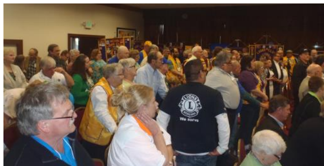
Lions crowd the room for the afternoon Business Meeting.