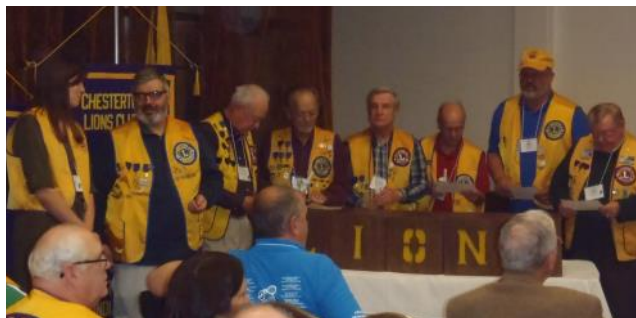
Lowell Lions Club members conduct the new member and new Leo's induction ceremony at the Business Meeting.

Best Western Hotel & Conference Center in LaPorte