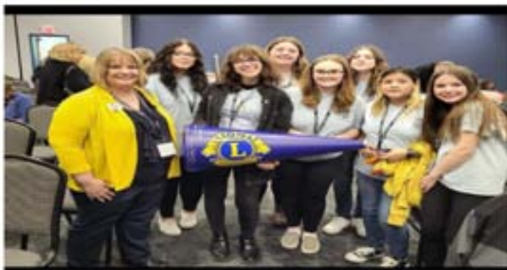
Congratulations Leo Club for winning the chant contest!