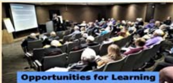
Opportunities for Learning

It's not too early to start planning for 2024. Mark your calendar now for the 2024 Mid-Winter Conference.