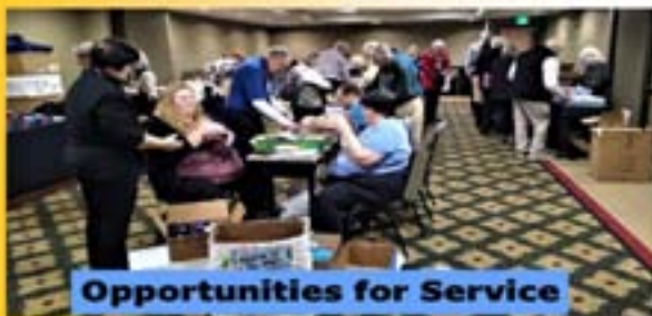
Opportunities for Service

It's not too early to start planning for 2024. Mark your calendar now for the 2024 Mid-Winter Conference.