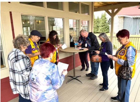
LOFS Lions pre-chant contest