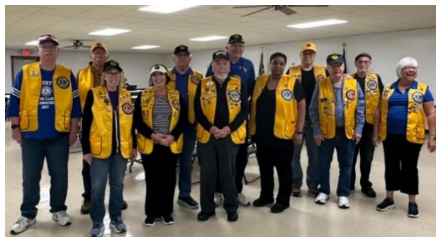
More pictures at the end of this newsletter.

And that's the way it was for the rest of the weekend. I estimated at least a dozen clubs and perhaps 50 Lions stood with the residents of Lake Village in their time of need. I couldn't help but think of my DG motto "Facta non Verba" (Deeds not Words) and the Lions International motto WE SERVE were so appropriate in this endeavor.