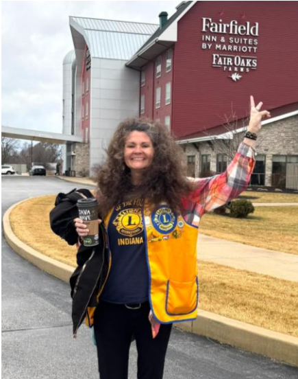
Friendly Lions Greeting You!