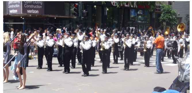
LaPorte High School Band won a Third Place in Bands