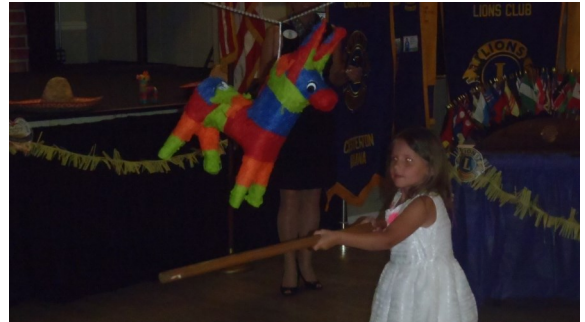
The Kids had fun trying to break the Pinata.