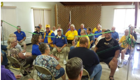
Chair Volleyball fun time at 25A Officer's Training day in Kouts.