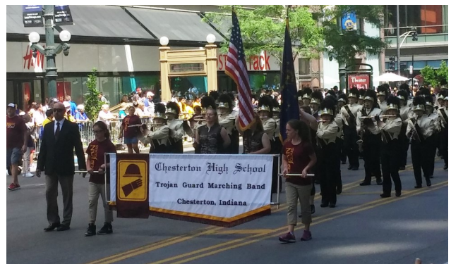
Chesterton High School Band in Parade

Welcome to Lions at McCormick Place Convention Center front entrance.