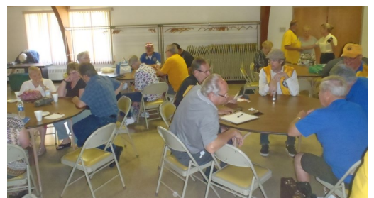
Part of the training group—one of the largest crowds ever at a 25A training session.