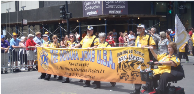
New MD25 District Governors parade on State Street