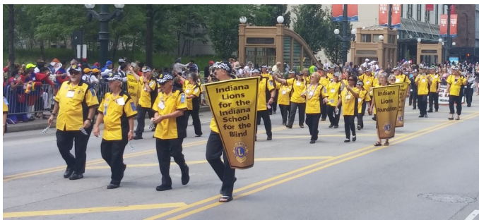
Indiana Lions display the State Projects in Parade