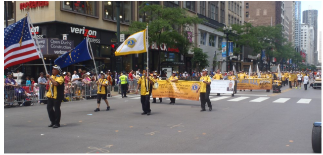
Indiana Lions delegation marching in Parade of Nations