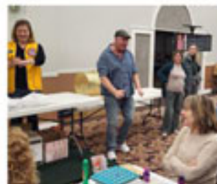
"Heads and Tails" is a great game and this gentleman was pretty happy!