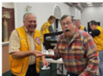
50/50 is always a hit!!!