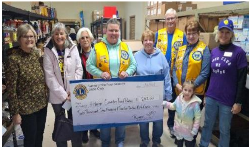
LOFS Lions with members of the Hebron Country Food Pantry