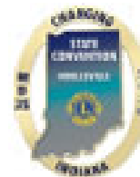
EXHIBIT AND VENDOR APPLICATION