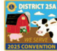
Exhibit and Vendor Application

Fair Oaks Farms 856 N 600 E Fair Oaks, Indiana 47943 March 8, 2025