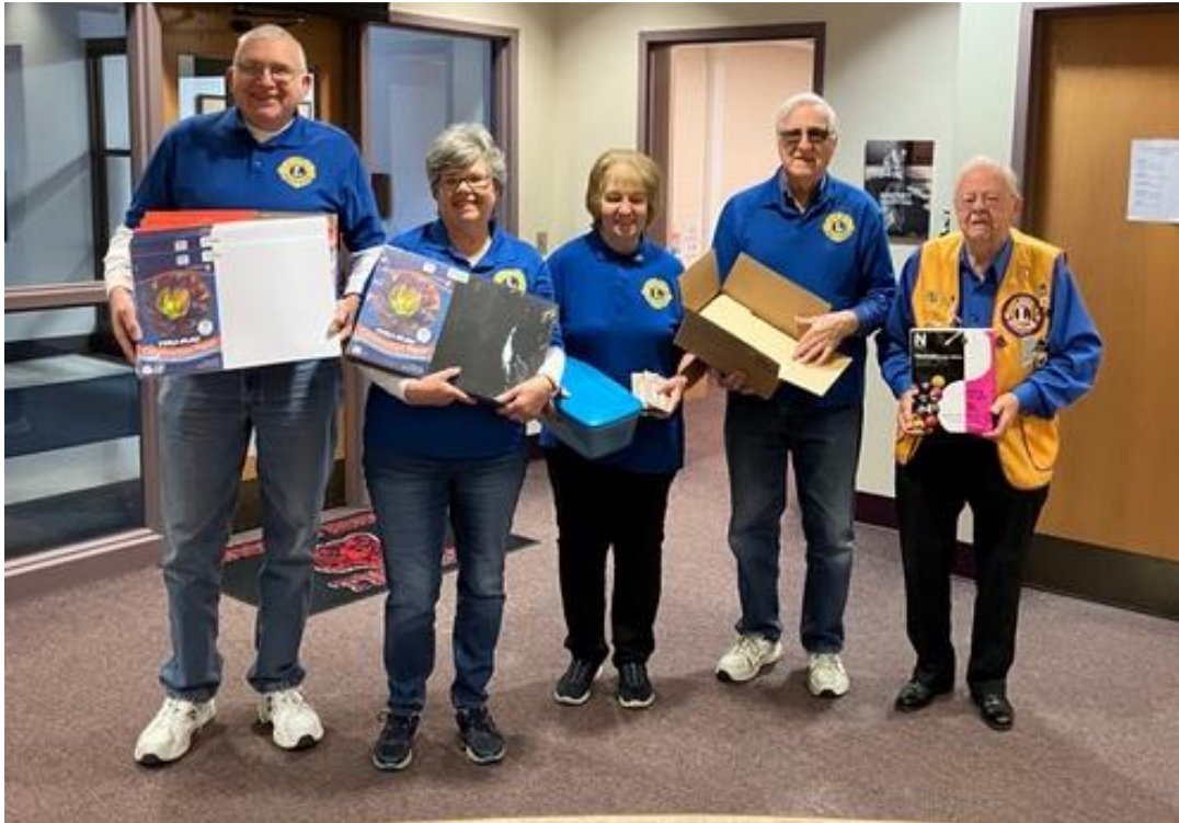
Kingsford Heights Elementary