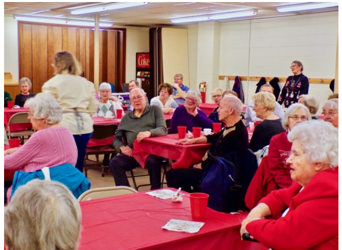
Above: Seniors attending the Dinner