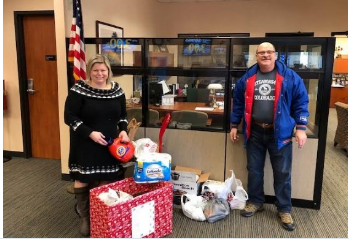
The Dyer Lions held a pantry drive and donated over $500 worth of food and cleaning supplies to the St. John Township pantry in December. A portion of the collection is shown in the picture. In November, we donated $400 worth of gift cards to families in need in Dyer for Thanksgiving and Christmas.