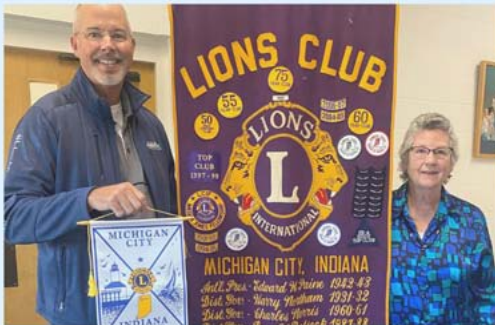
Pictured below left to right:

Members were reminded of the combined Rotary/Lions Program which will be at The Salvation Army on November 17th at noon.