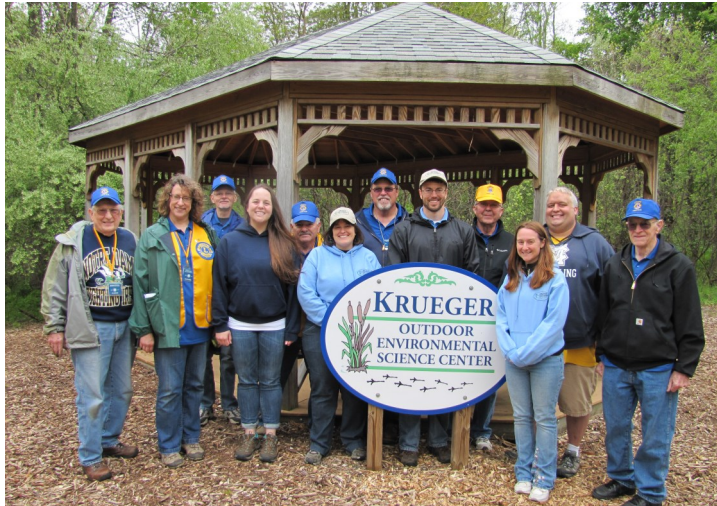
Michiana Lions and Krueger School officials at the school gazebo.