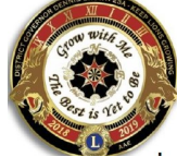
PDG PDG PDG jacket