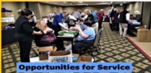
Opportunities for Service

It's not too early to start planning for 2024. Mark your calendar now for the 2024 Mid-Winter Conference.