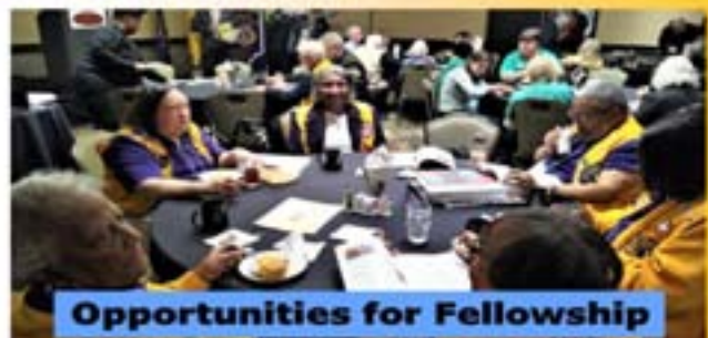
Opportunities for Fellowship

Crowne Plaza Indianapolis Airport January 19-20, 2024