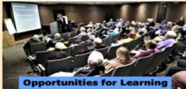
Opportunities for Learning

It's not too early to start planning for 2024. Mark your calendar now for the 2024 Mid-Winter Conference.