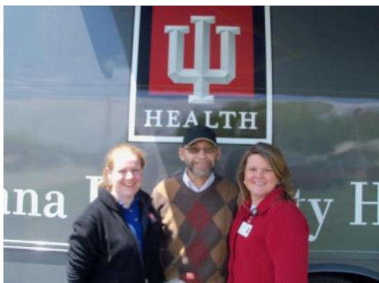
Our IU Health LaPorte Hospital Mobile Unit team.