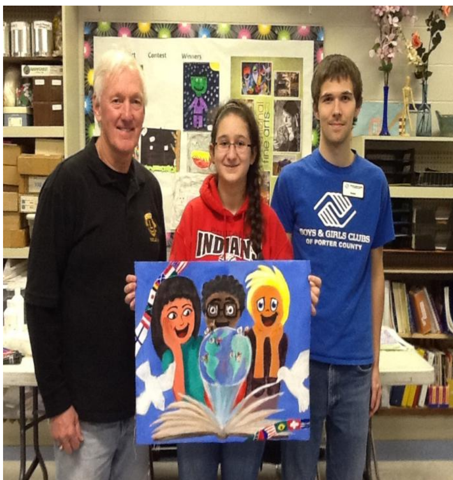
2013-2014 Peace Poster Winner from District 25A. Portage Lions sponsored. Took 2nd place in state of Indiana Lions

District 25A held a total of 106 eye screening sessions and saw 2789 children and referred 151 of those.