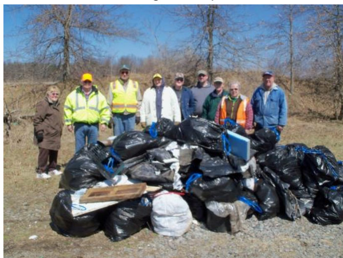
10th annual Roadside Cleanup. Lions and community non-lions walked approximately 12 miles of roadway with 62 bags of litter collected.

On May 17 the Mill Creek Community Lions Club partnered with the Fish Lake Library and IU Health LaPorte Hospital to provide screenings for Diabetes, Bone Density and Blood Pressure by IU Health and Eye Screening and Glaucoma screening by the Mill Creek Community Lions. A total of 113 screenings were performed on 26 adults.