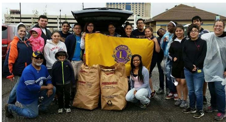
LEFT The crew from the East Chicago Lions Club beach cleanup.