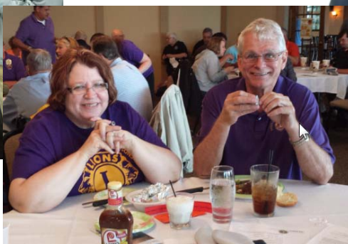
Above. Chefs working on their steaks at the recent Meeting