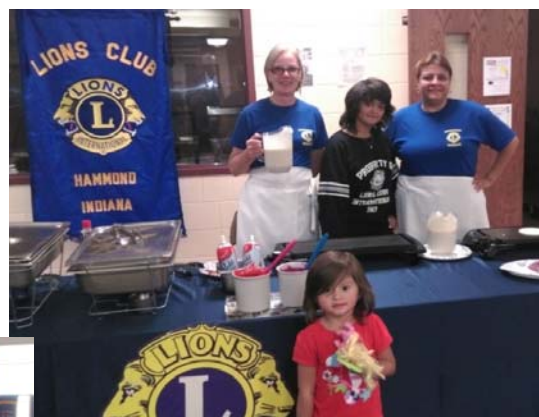
ABOVE The chefs at the Hammond Lion's Club terrific pan cake breakfast on Sunday 6/7.