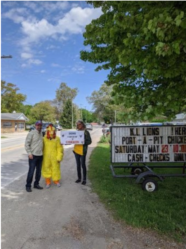
Above and Below: Koontz Lake Lions at their recent Drive Thru Nelson Chicken event